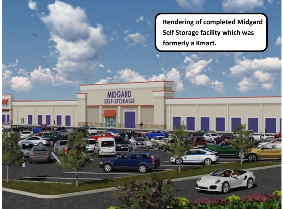
Rendering of completed Midgard Self Storage facility which was formerly a Kmart.