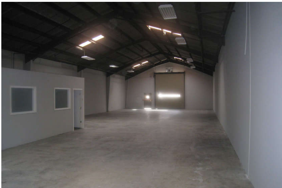
Fully Insulated and Sprinklered Warehouse

The information contained herein has been given to us by the owner of the property or other sources we deem reliable. We have no reason to doubt its accuracy, but we do not guarantee it. All information should be verified prior to purchase or lease.