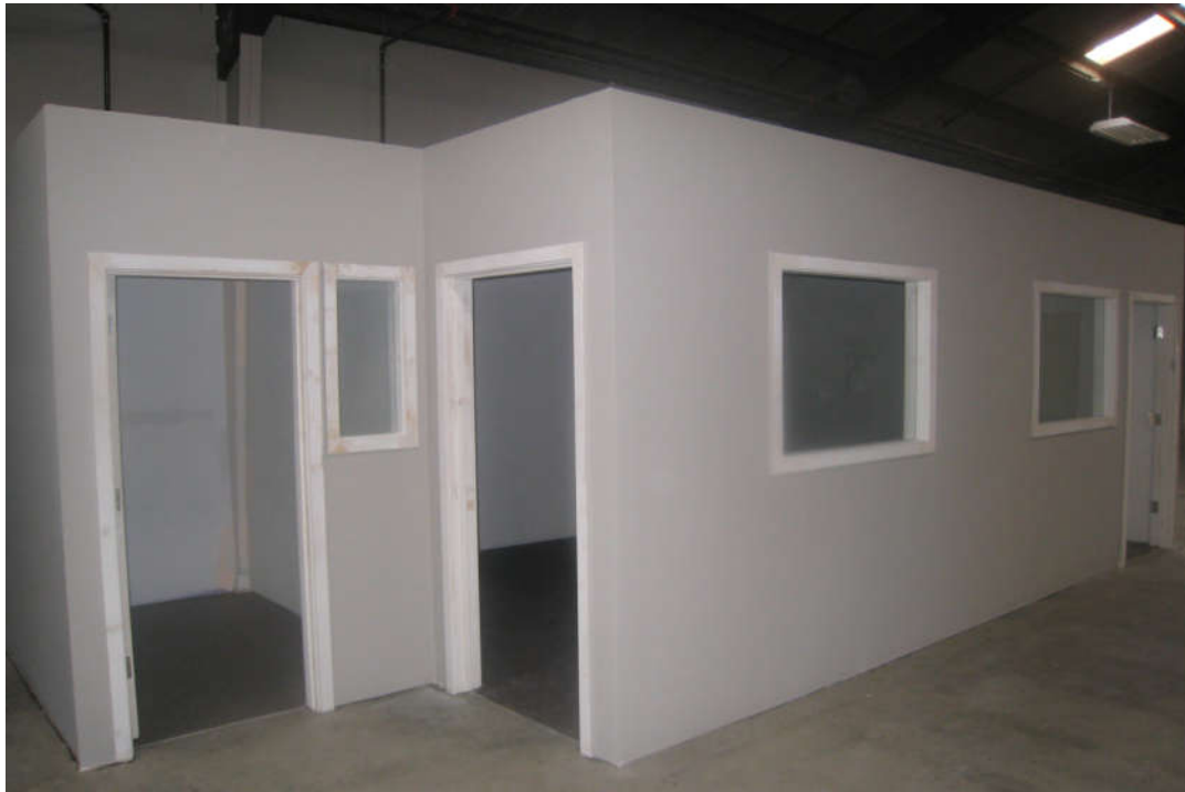
New Construction Offices