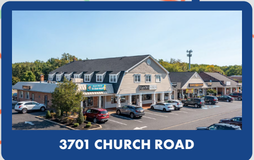
3701 CHURCH ROAD