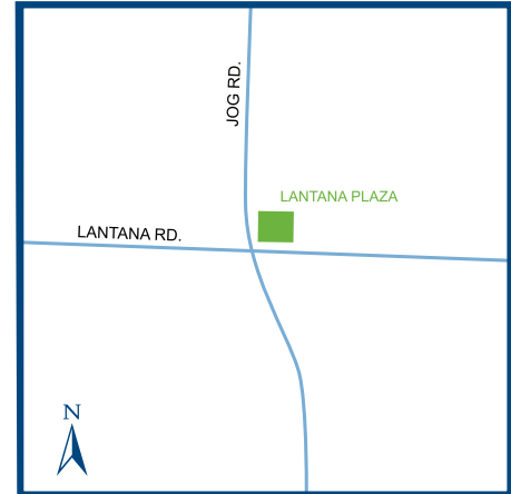
LANTANA PLAZA 5970 Jog Road Lake Worth, FL 33463