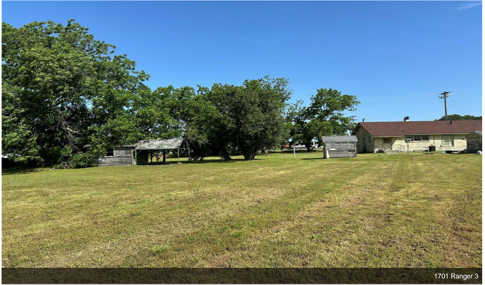
1701 Ranger 3