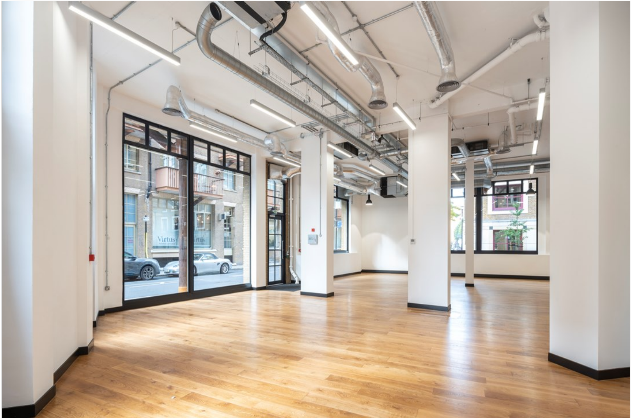
The Circle , 13-16 Queen Elizabeth Street, London, SE1 2JE