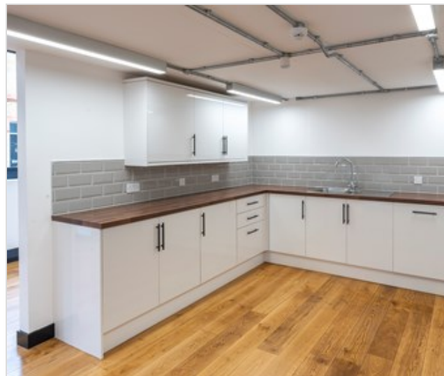
The Circle , 13-16 Queen Elizabeth Street, London, SE1 2JE