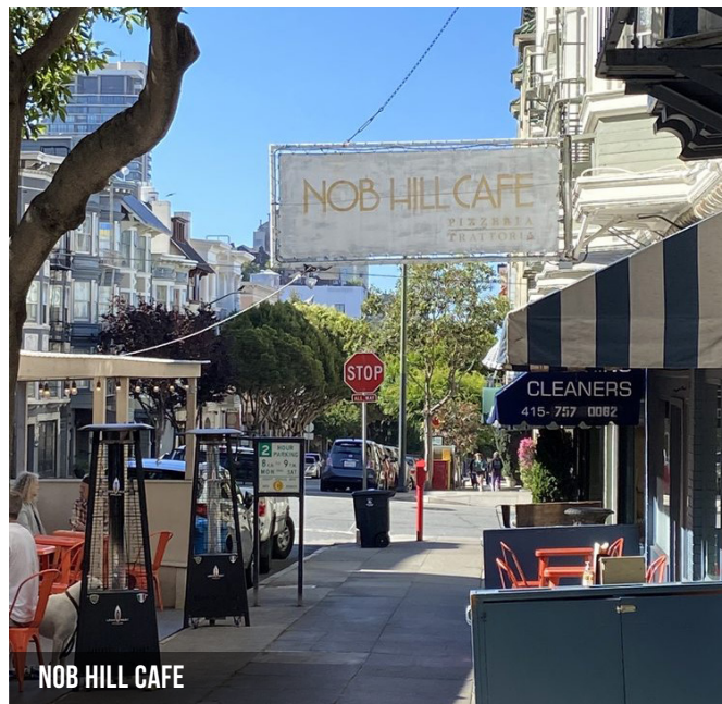
NOB HILL CAFE