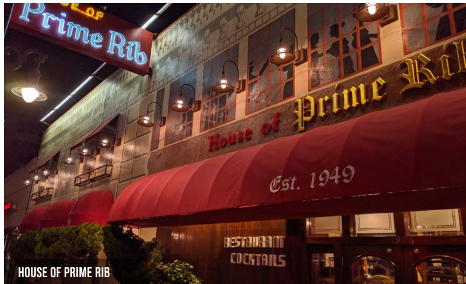
HOUSE OF PRIME RIB