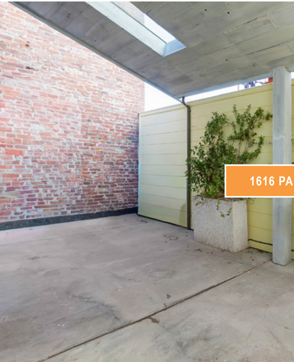
1616 PACIFIC AVE