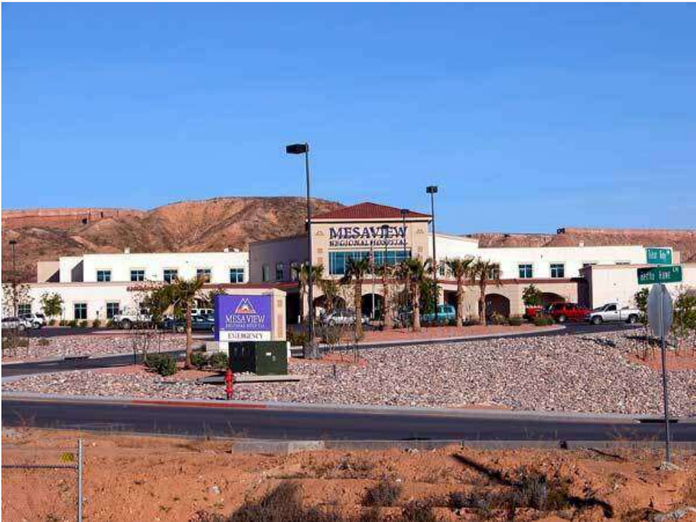
Mesa-View-Hospital in Mesquite