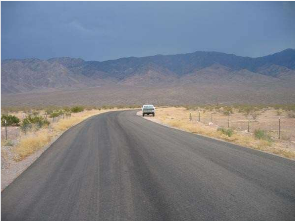
Highway 91 thru Site