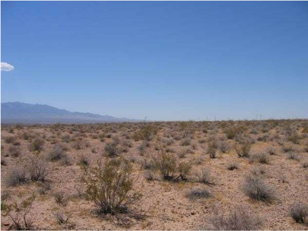
2% slope on property