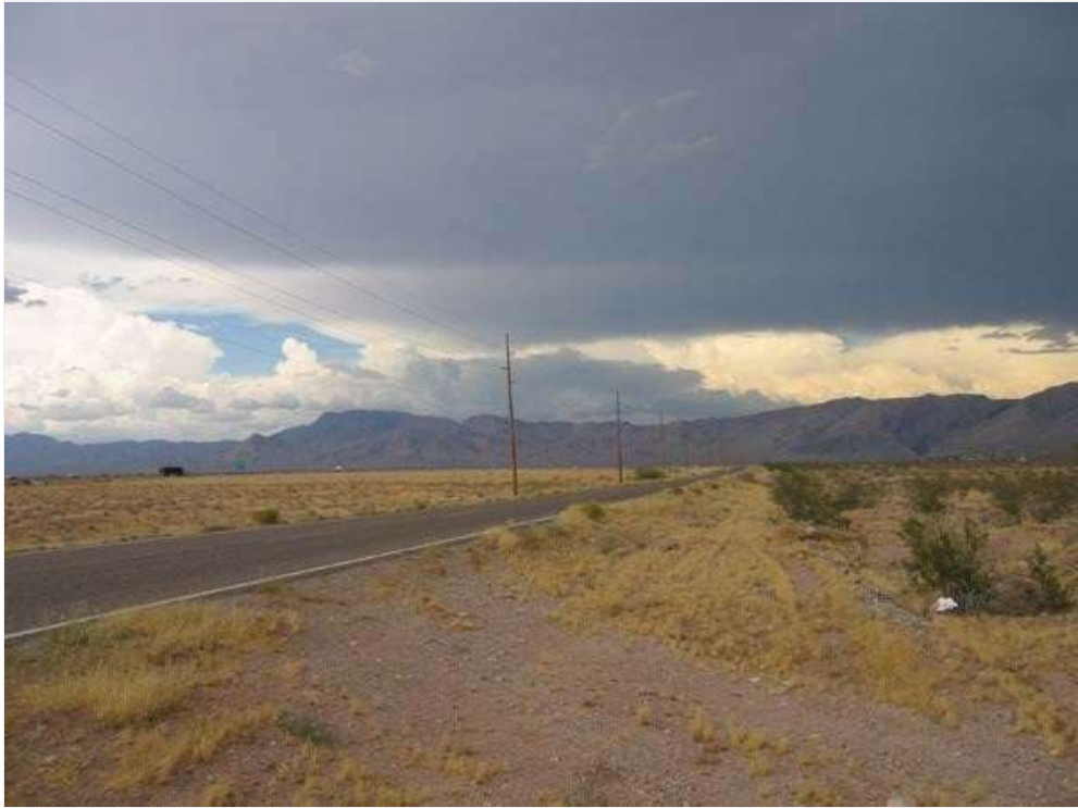
Highway 91 access thru property