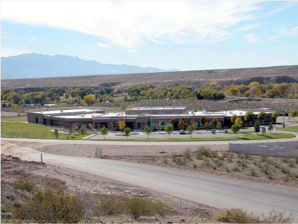
Nearby Elementary School