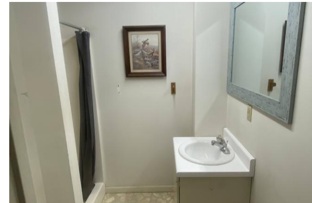
½ Bath With Shower