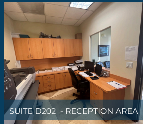
SUITE D202 - RECEPTION AREA