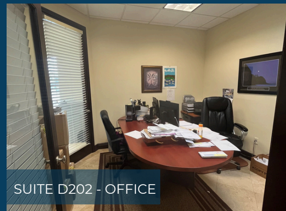
SUITE D202 - OFFICE