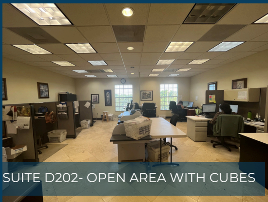
SUITE D202- OPEN AREA WITH CUBES