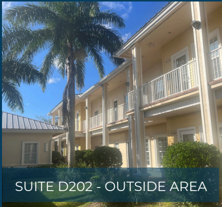
SUITE D202 - OUTSIDE AREA