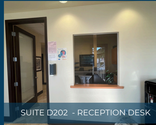
SUITE D202 - RECEPTION DESK