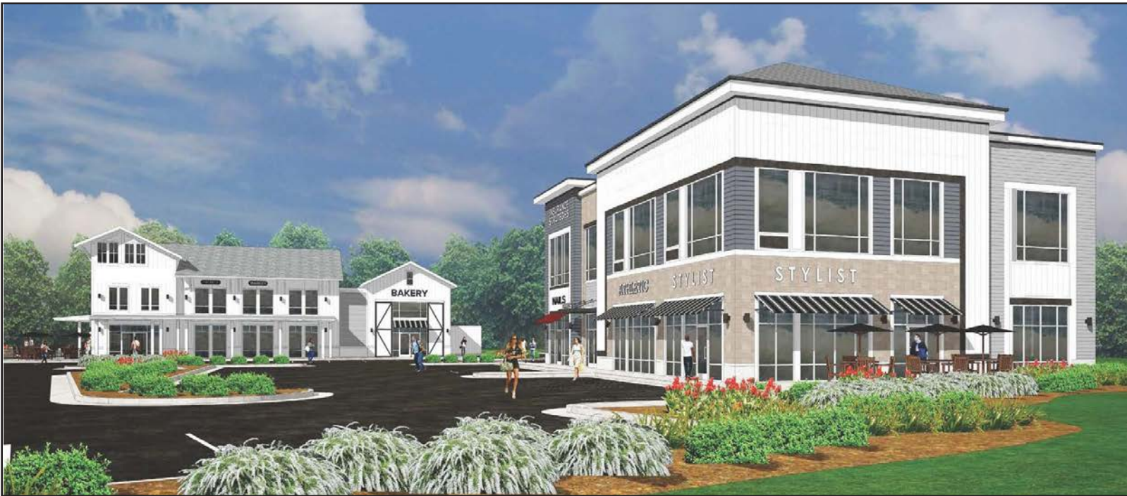
New Retail/Office Building | 1988 Fisher Arch, Virginia Beach, VA