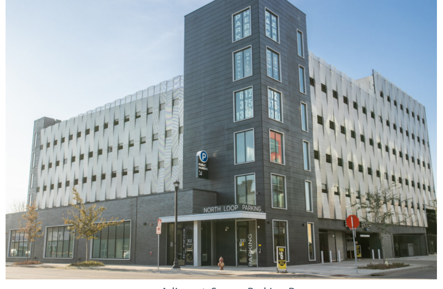
Adjacent, Secure Parking Ramp