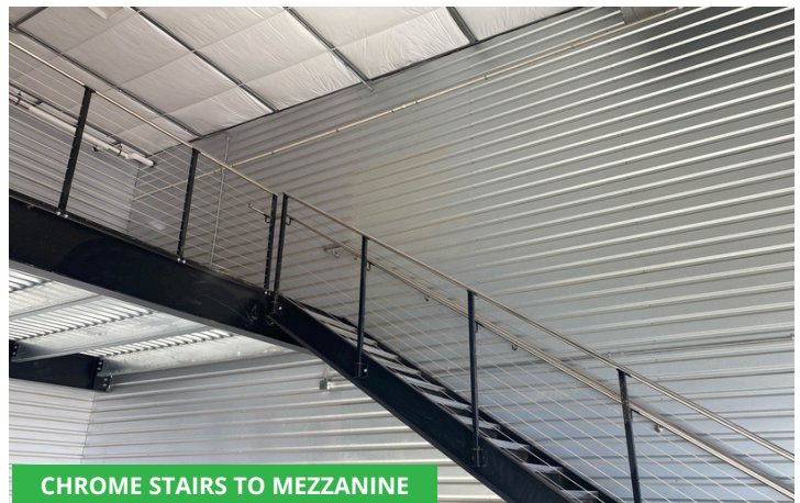
CHROME STAIRS TO MEZZANINE