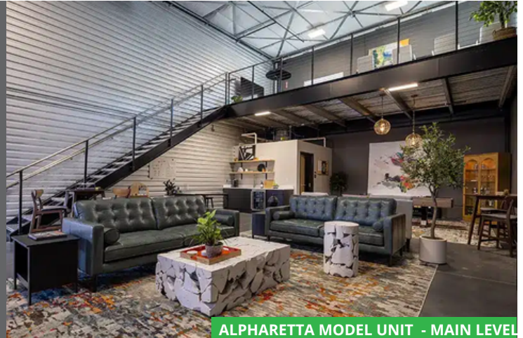
ALPHARETTA MODEL UNIT - MAIN LEVEL