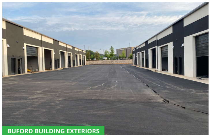
BUFORD BUILDING EXTERIORS