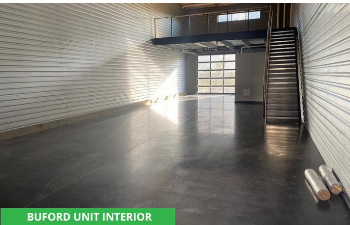
BUFORD UNIT INTERIOR