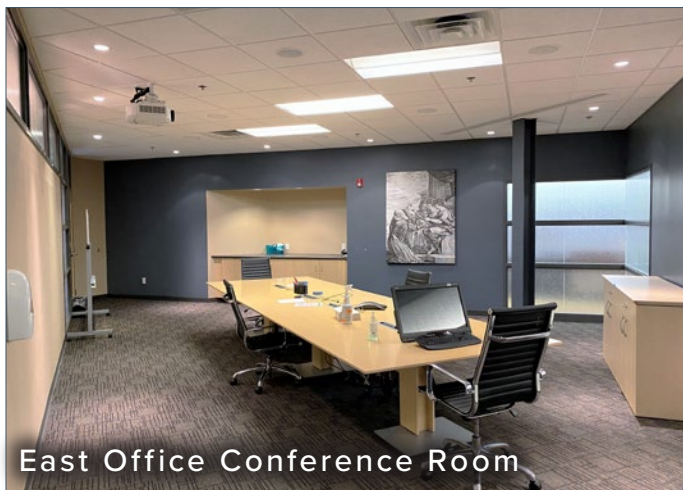
East Office Conference Room