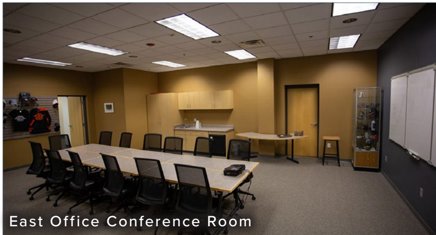
East Office Conference Room