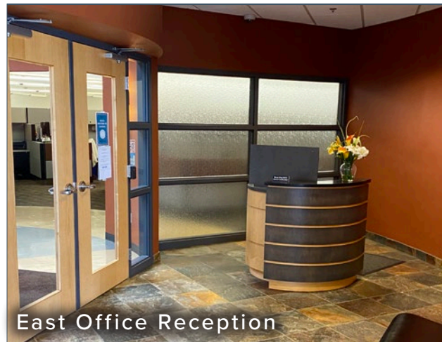
East Office Reception