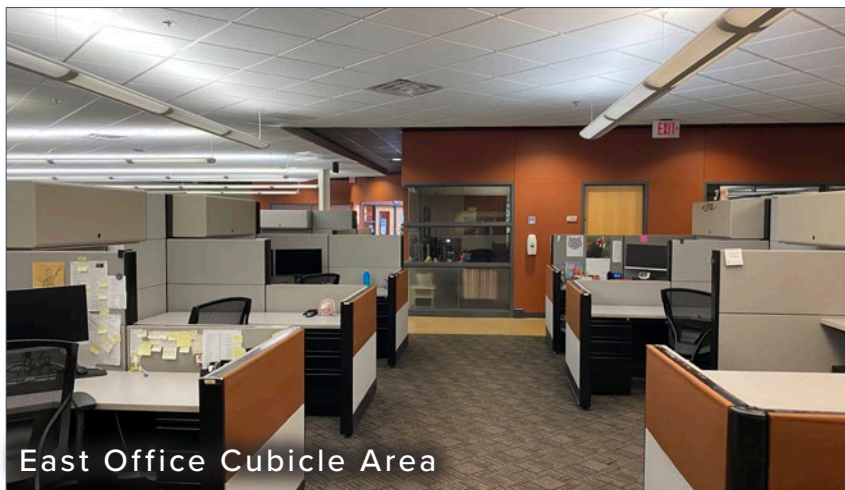
East Office Cubicle Area