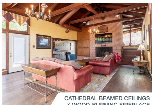
CATHEDRAL BEAMED CEILINGS & WOOD-BURNING FIREPLACE