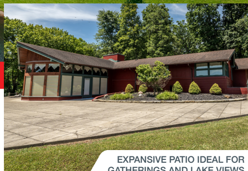
EXPANSIVE PATIO IDEAL FOR GATHERINGS AND LAKE VIEWS

Whether you're seeking a quiet escape, a nature lover's paradise, or a unique investment, The Lodge offers something truly special.