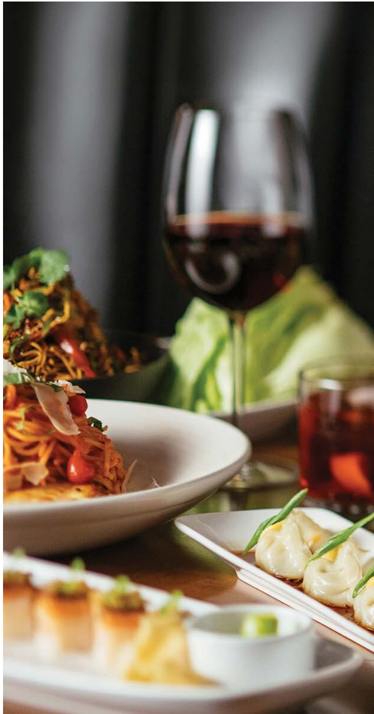
JOEY NEWPORT BEACH