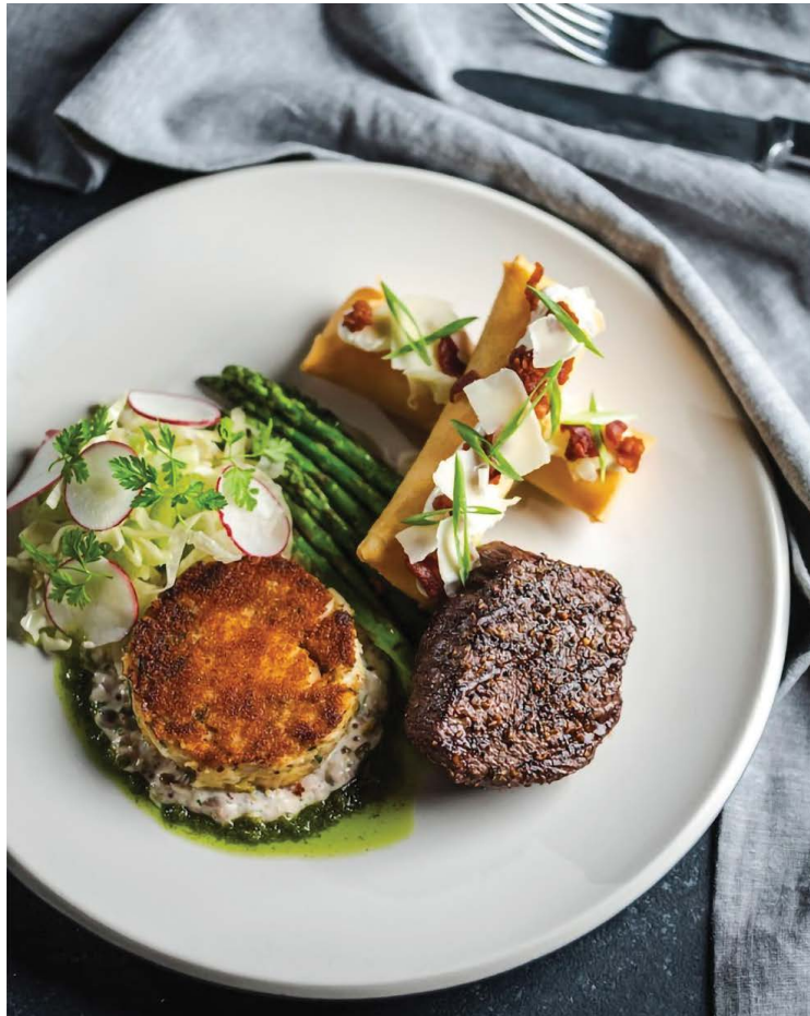
JOEY NEWPORT BEACH