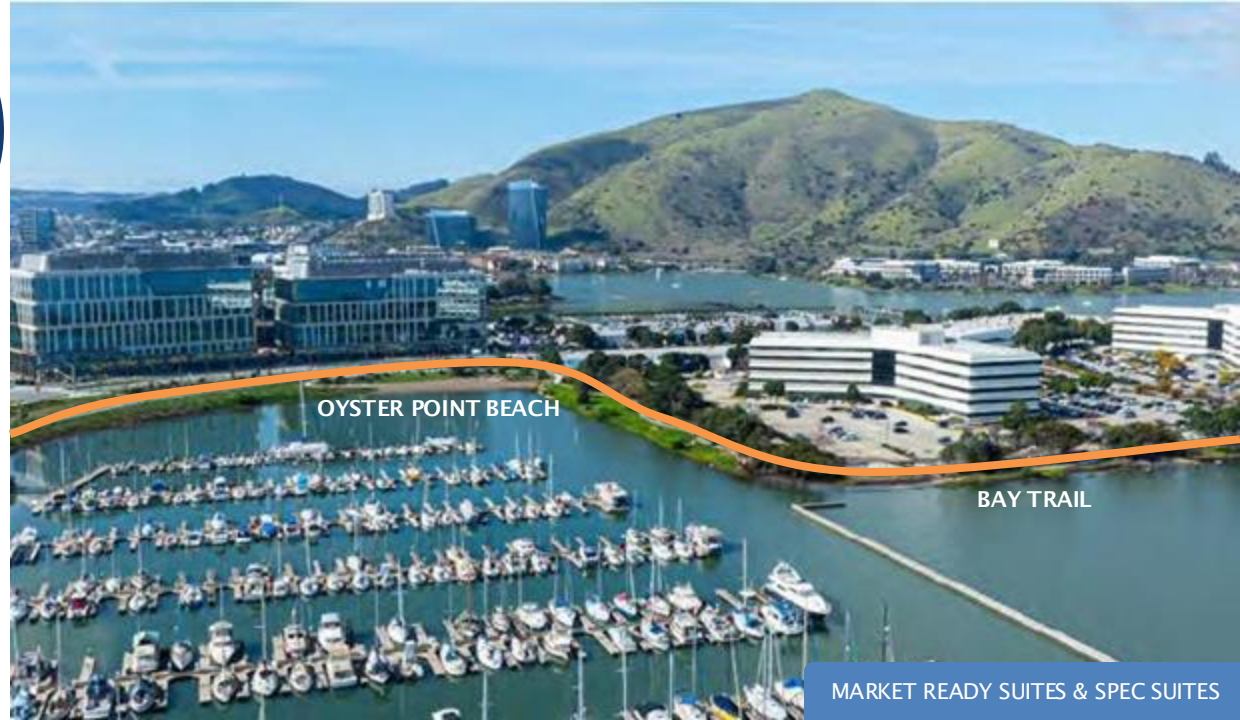
OYSTER POINT BEACH