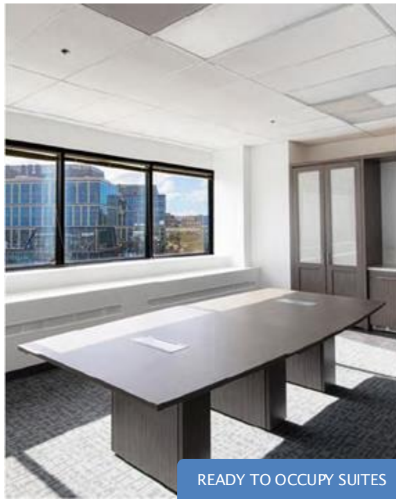
READY TO OCCUPY SUITES