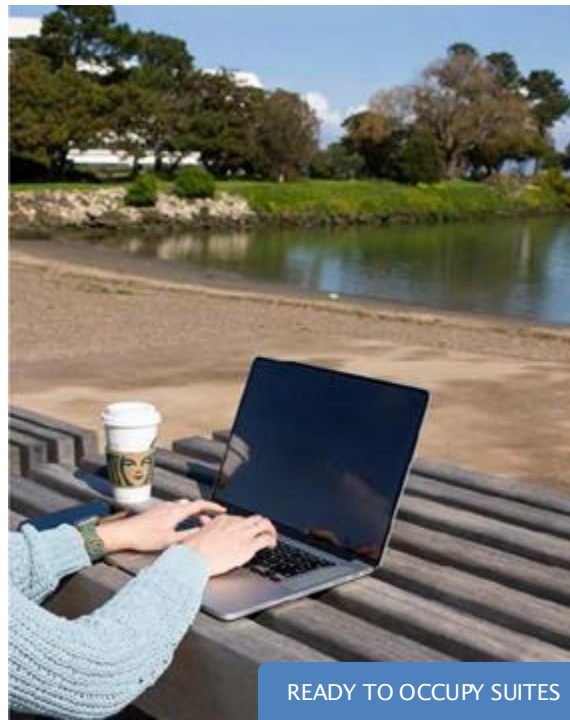
READY TO OCCUPY SUITES