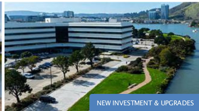
NEW INVESTMENT & UPGRADES