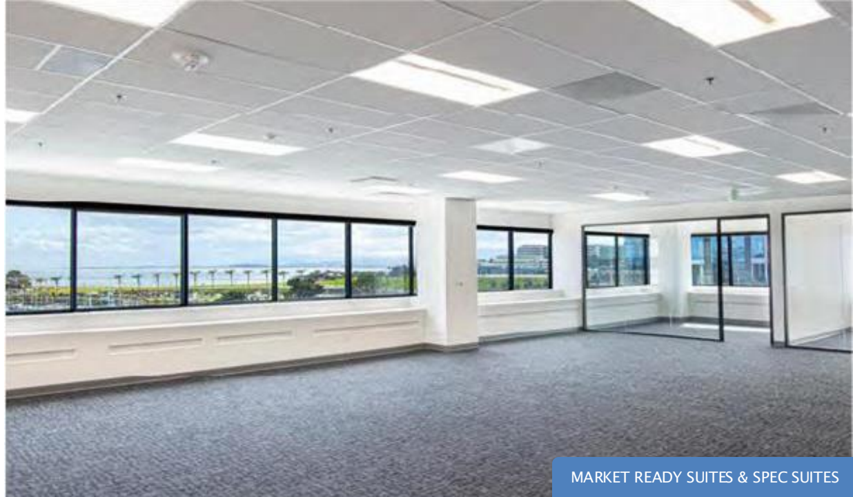
MARKET READY SUITES & SPEC SUITES