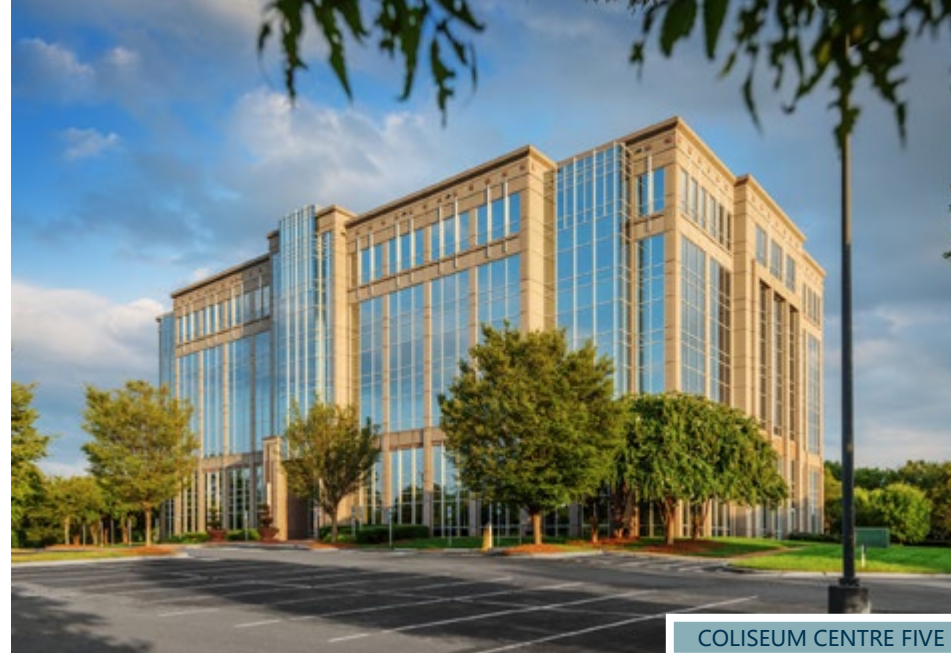
COLISEUM CENTRE FIVE

Walking Distance to To Hotels, Restaurants & Retail