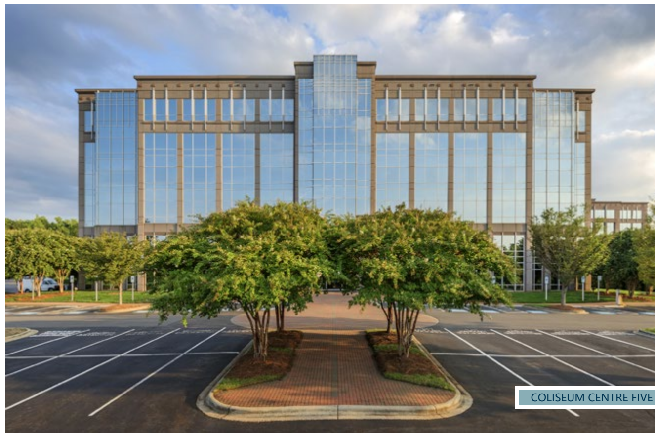
COLISEUM CENTRE FIVE