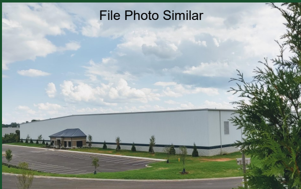
File Photo Similar