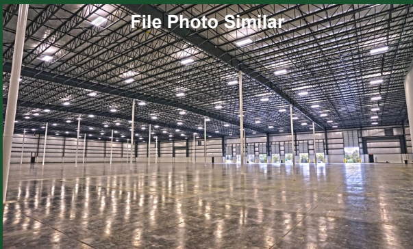
File Photo Similar