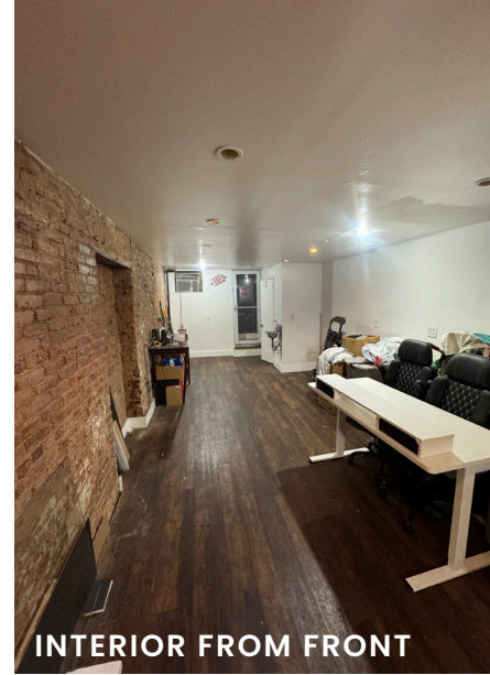
INTERIOR FROM FRONT