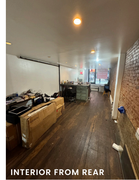
INTERIOR FROM REAR