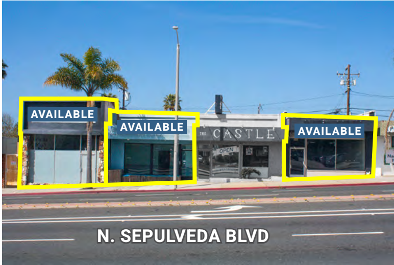
N. SEPULVEDA BLVD

2317-2417 N. SEPULVEDA BLVD, MANHATTAN BEACH, CA 90266