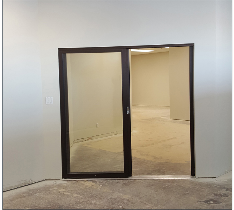
Suite 110 - 1,224 sq. ft.