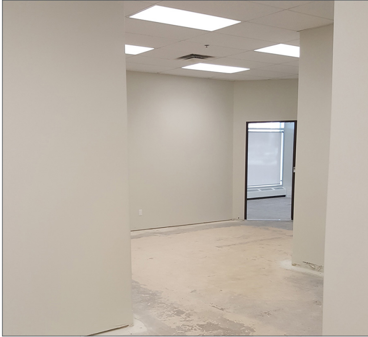
Suite 106 - 1,307 sq. ft.