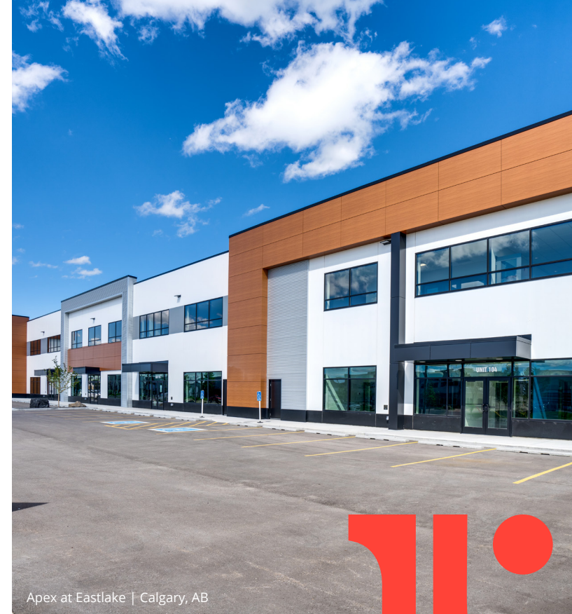
Apex at Eastlake | Calgary, AB