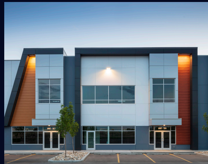
Evolve at District | Calgary, AB