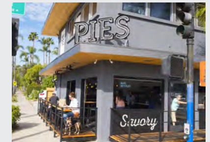
Pop Pie Co.