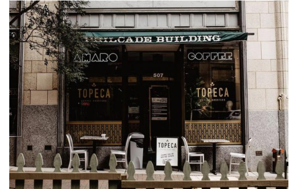
Topeca Coffee – Philcade Building