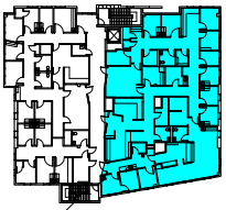
② SUITE 301 KEY PLAN 1" = 100'-0"