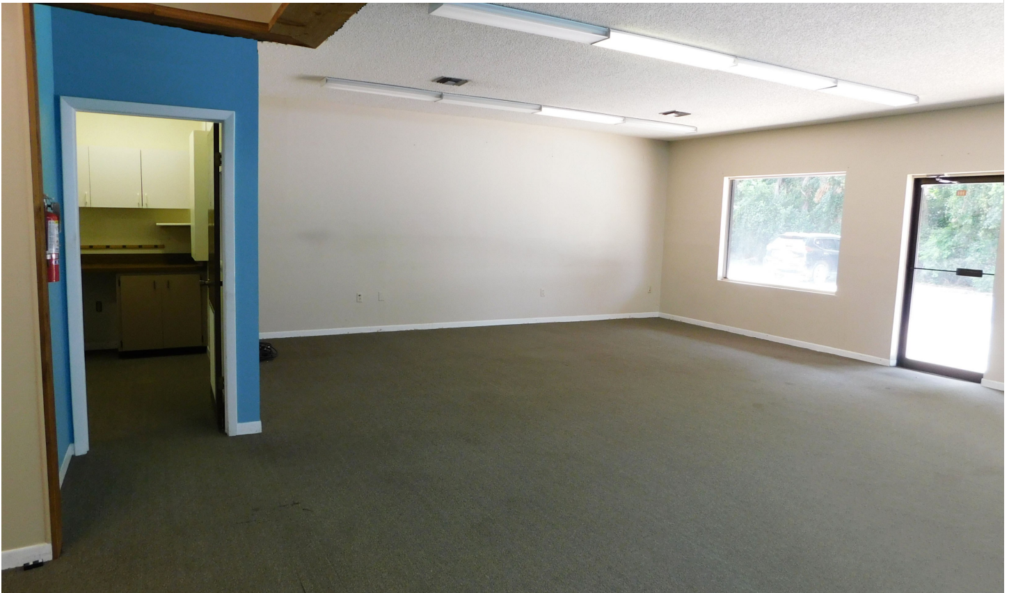
Suite 101 - 952 SF

950 & 956 N Cocoa Blvd., Cocoa, FL 32922