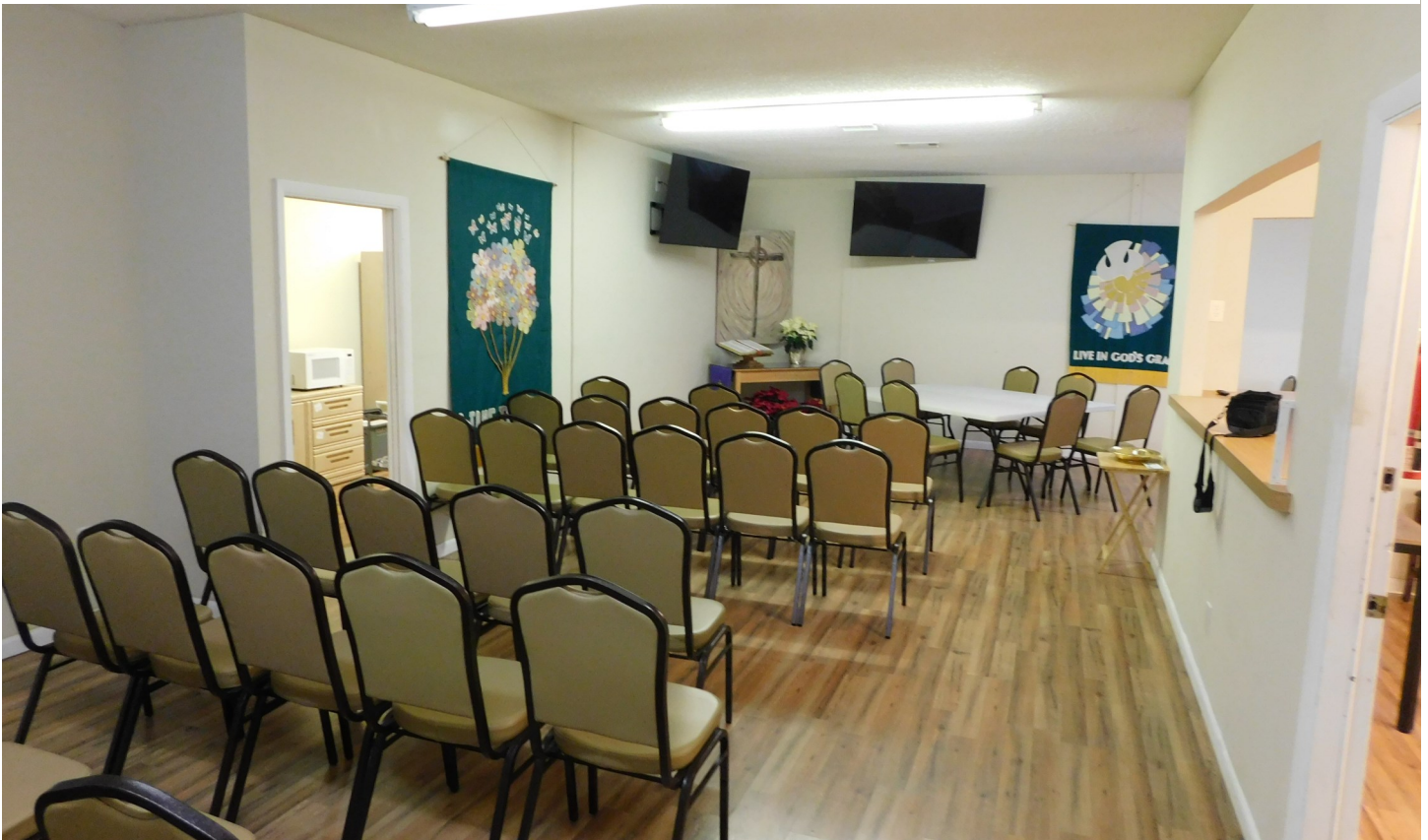
Suite 1129/1131 - 1,462 SF

950 & 956 N Cocoa Blvd., Cocoa, FL 32922