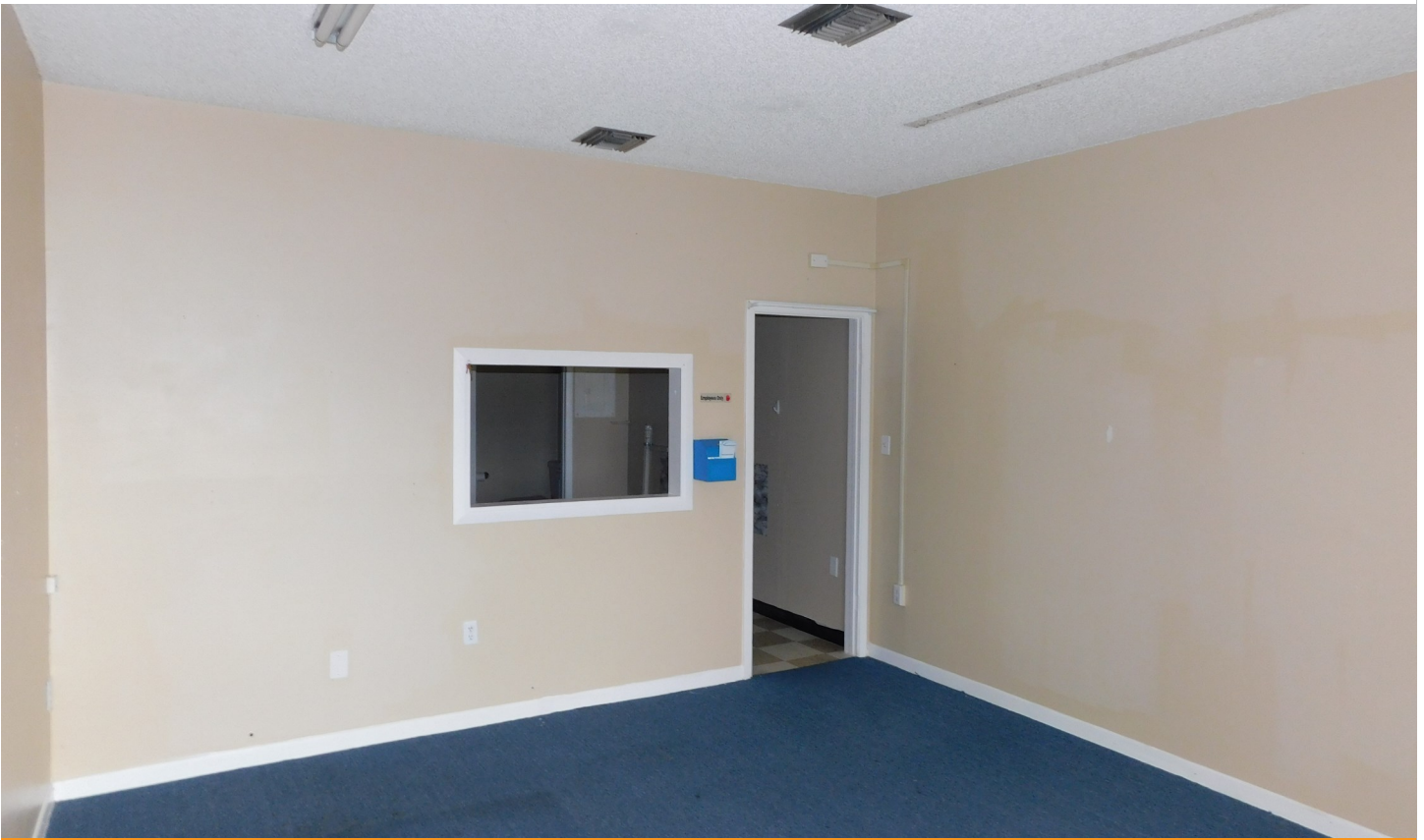
Suite 1111 - 476 SF

950 & 956 N Cocoa Blvd., Cocoa, FL 32922