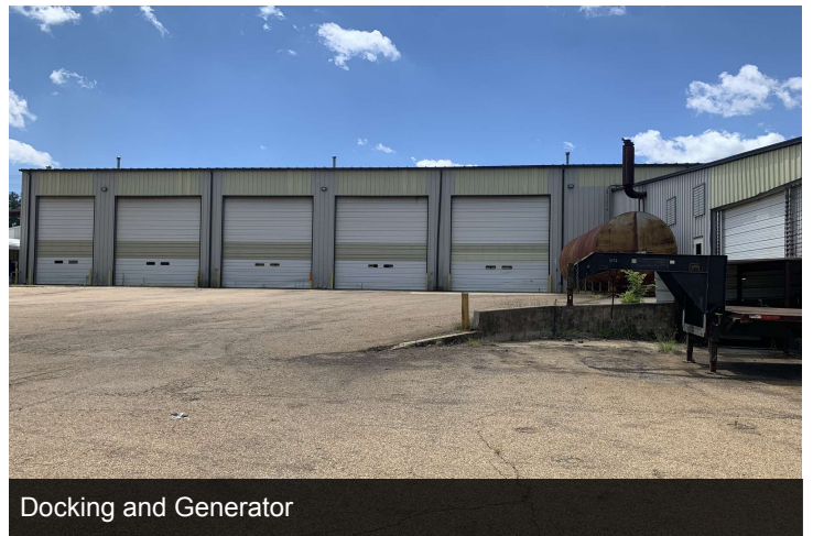
Docking and Generator