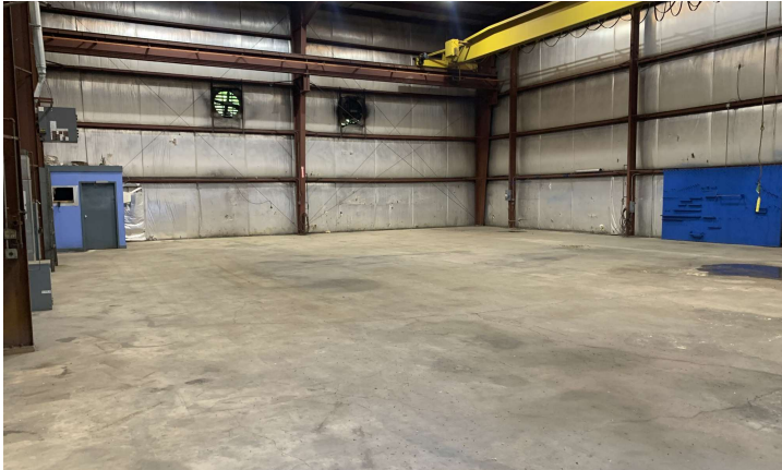
Warehouse - Clear Span