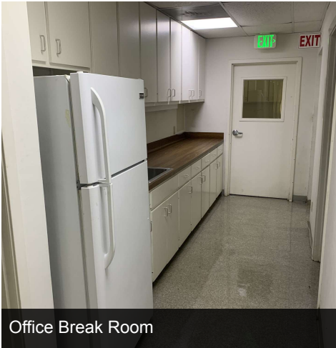
Office Break Room