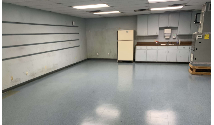
Warehouse Break Room