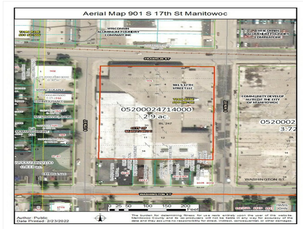
901 S 17th St Manitowoc Aerial Map