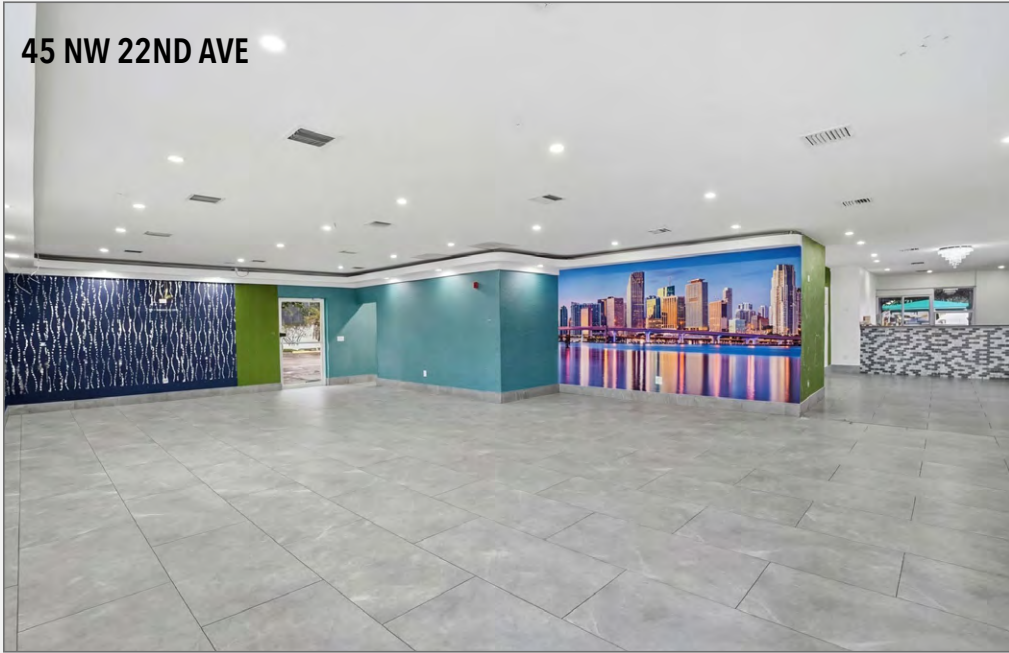
45 NW 22ND AVE