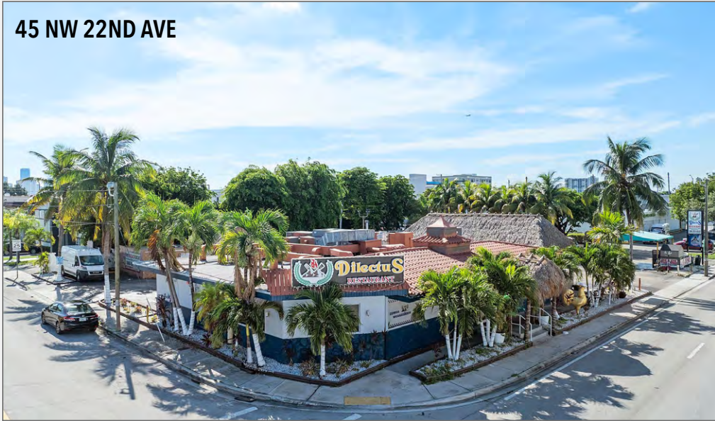
45 NW 22ND AVE