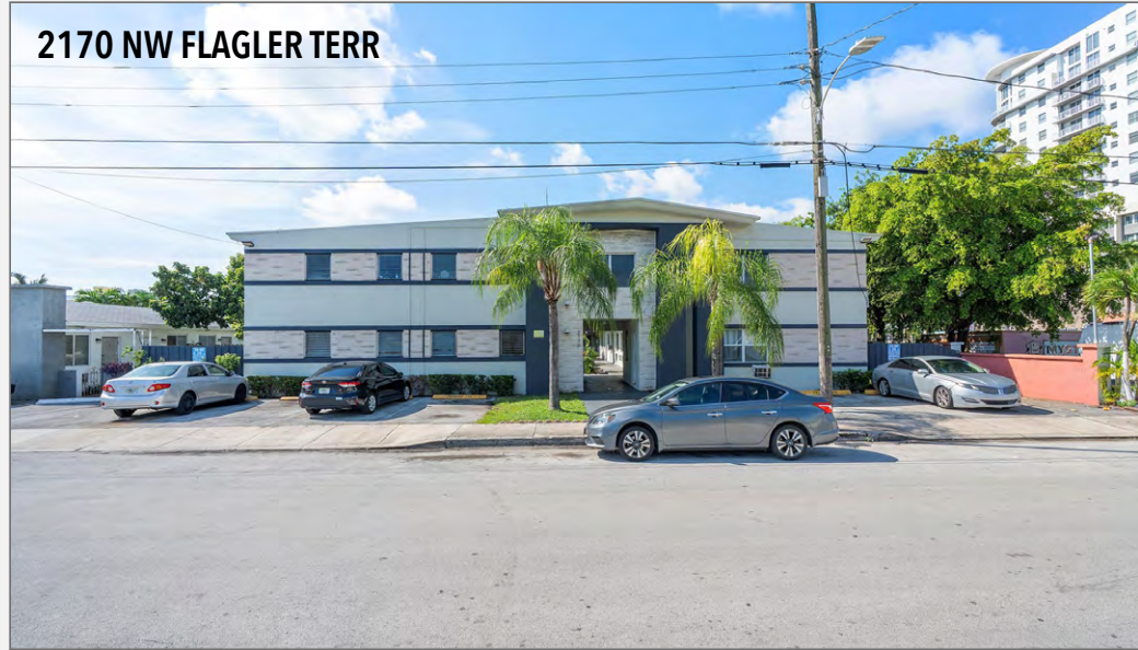
2170 NW FLAGLER TERR