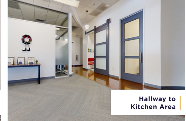
Hallway to Kitchen Area