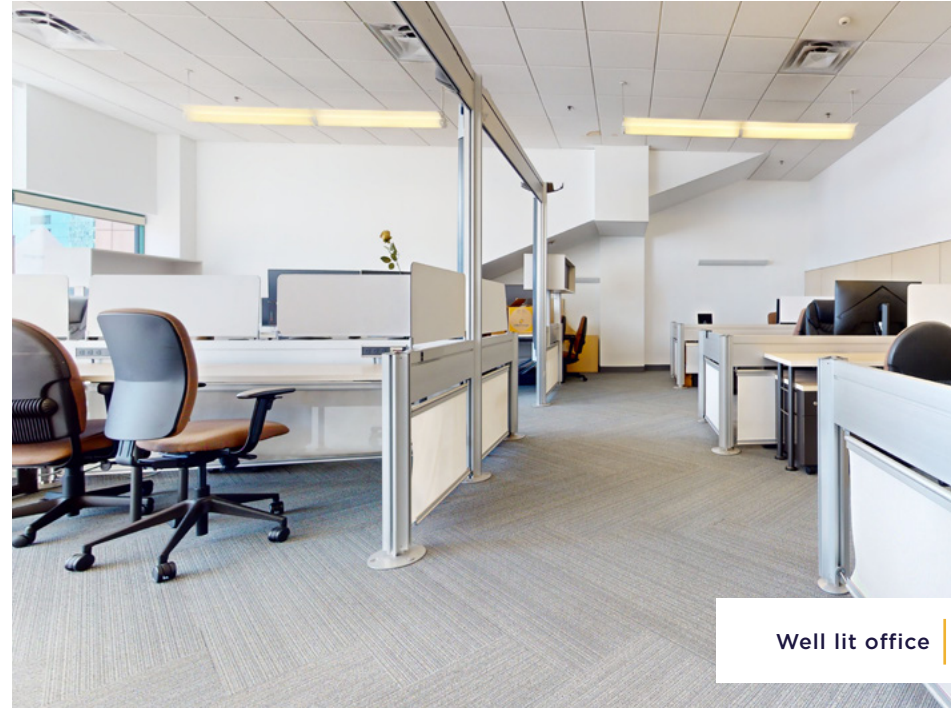
Well lit office