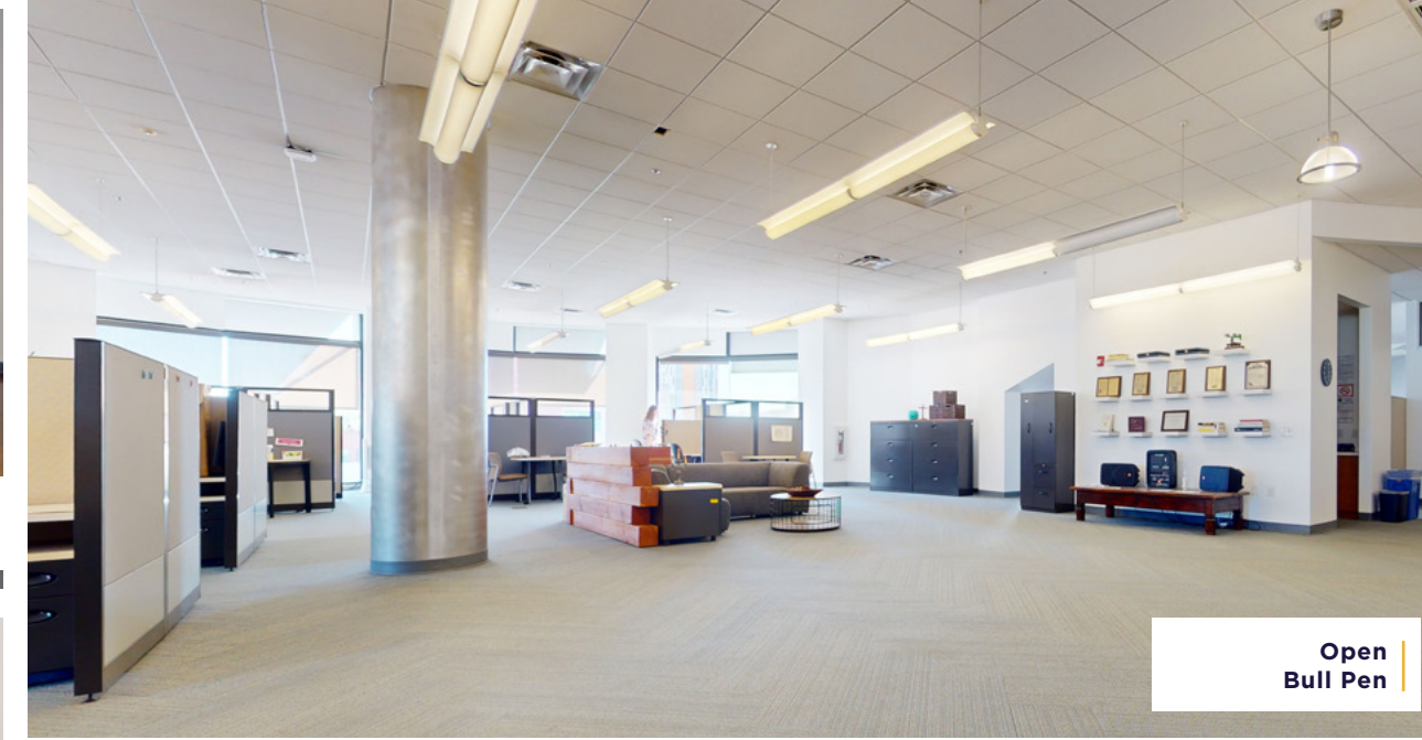
Open Bull Pen