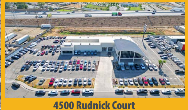
4500 Rudnick Court