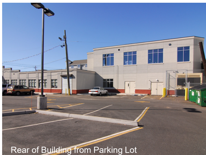
Rear of Building from Parking Lot