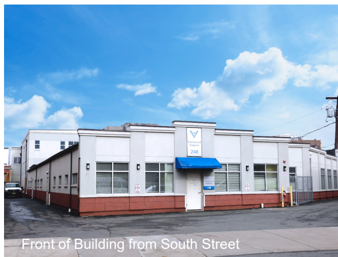
Front of Building from South Street

201 Route 17 North, Rutherford, NJ 07070 One Tower Center Boulevard, Suite 2201, East Brunswick, NJ 08816