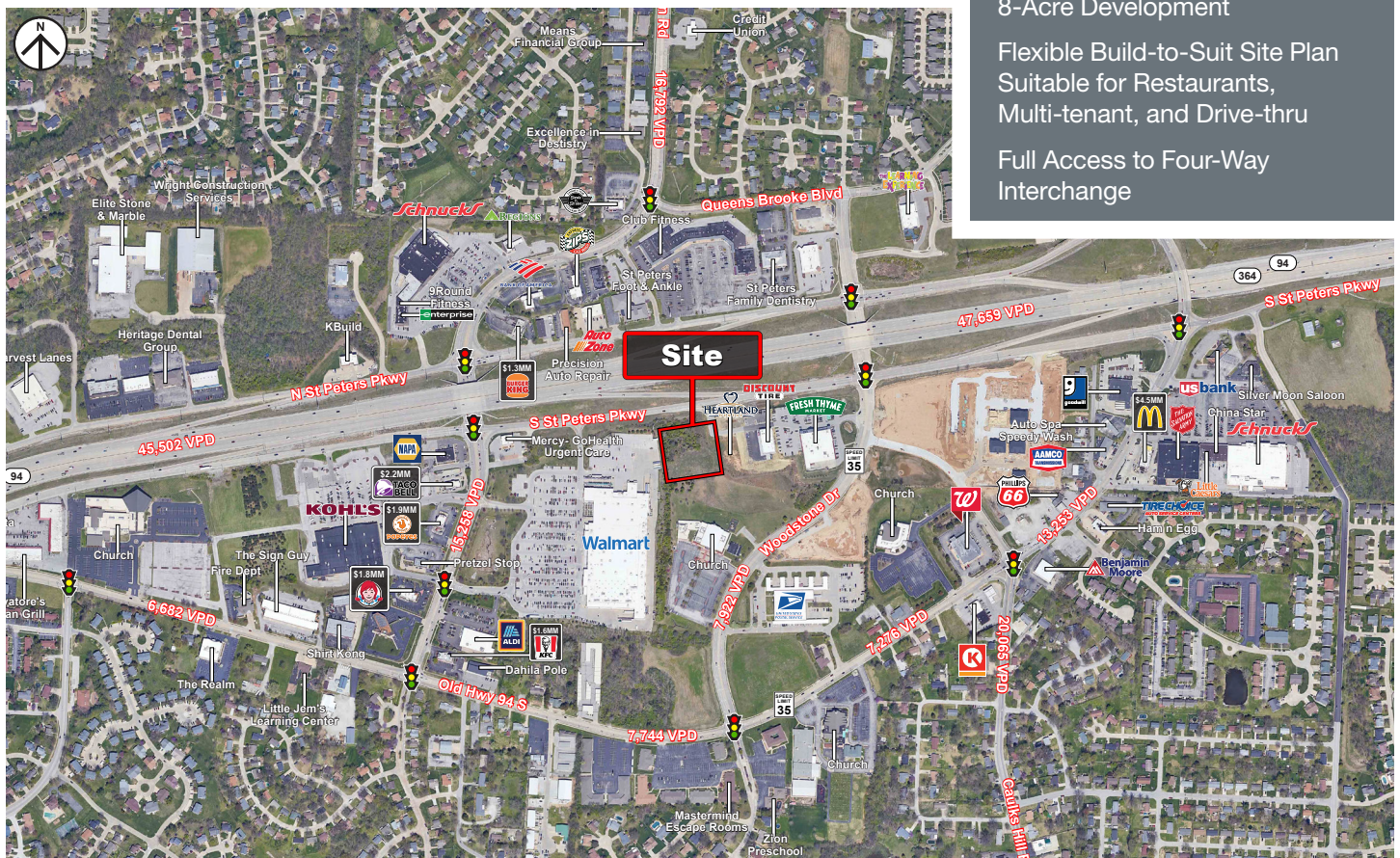
Sales Data Sourced from Restaurant Trends