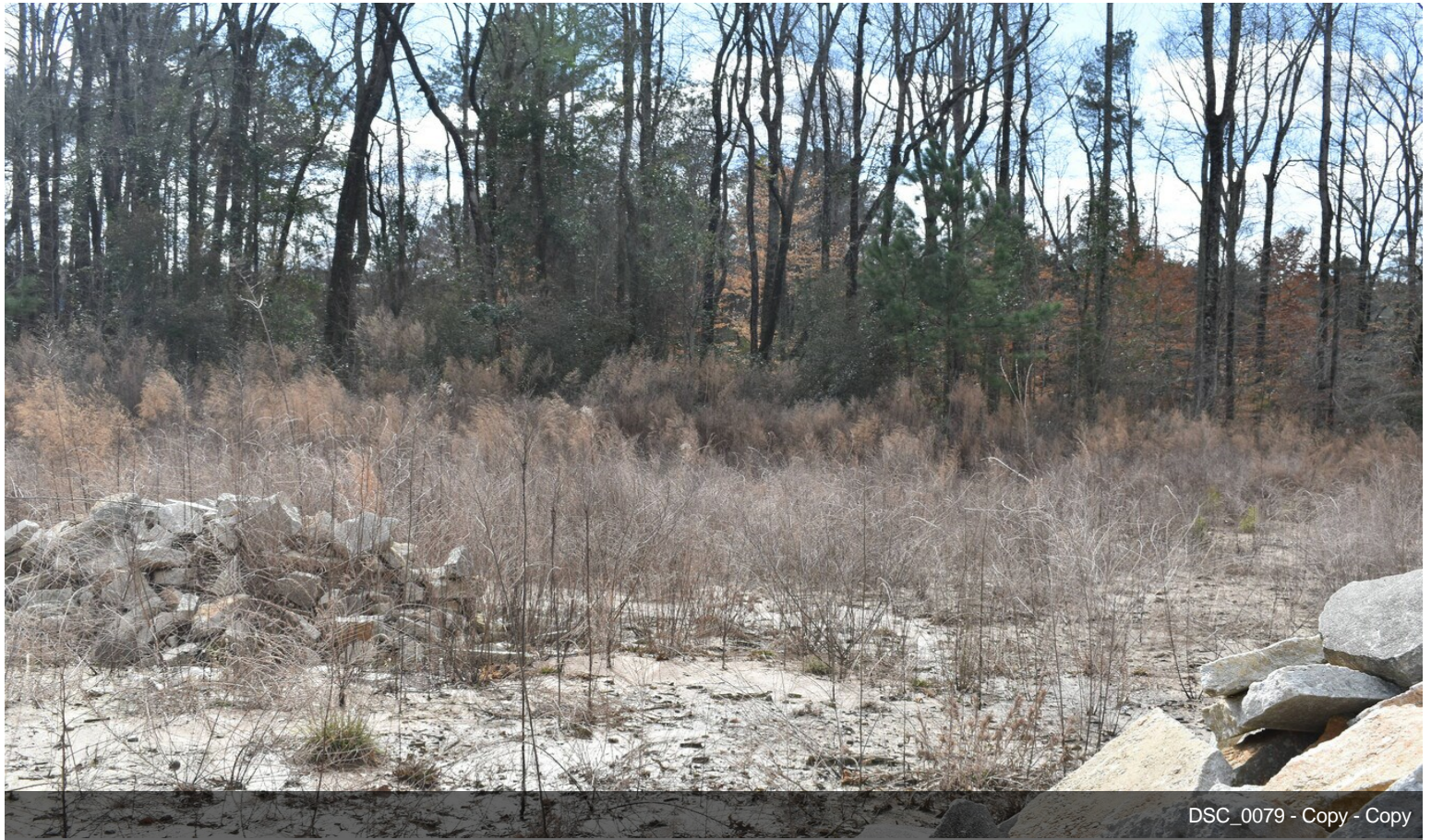
DSC_0079 - Copy - Copy