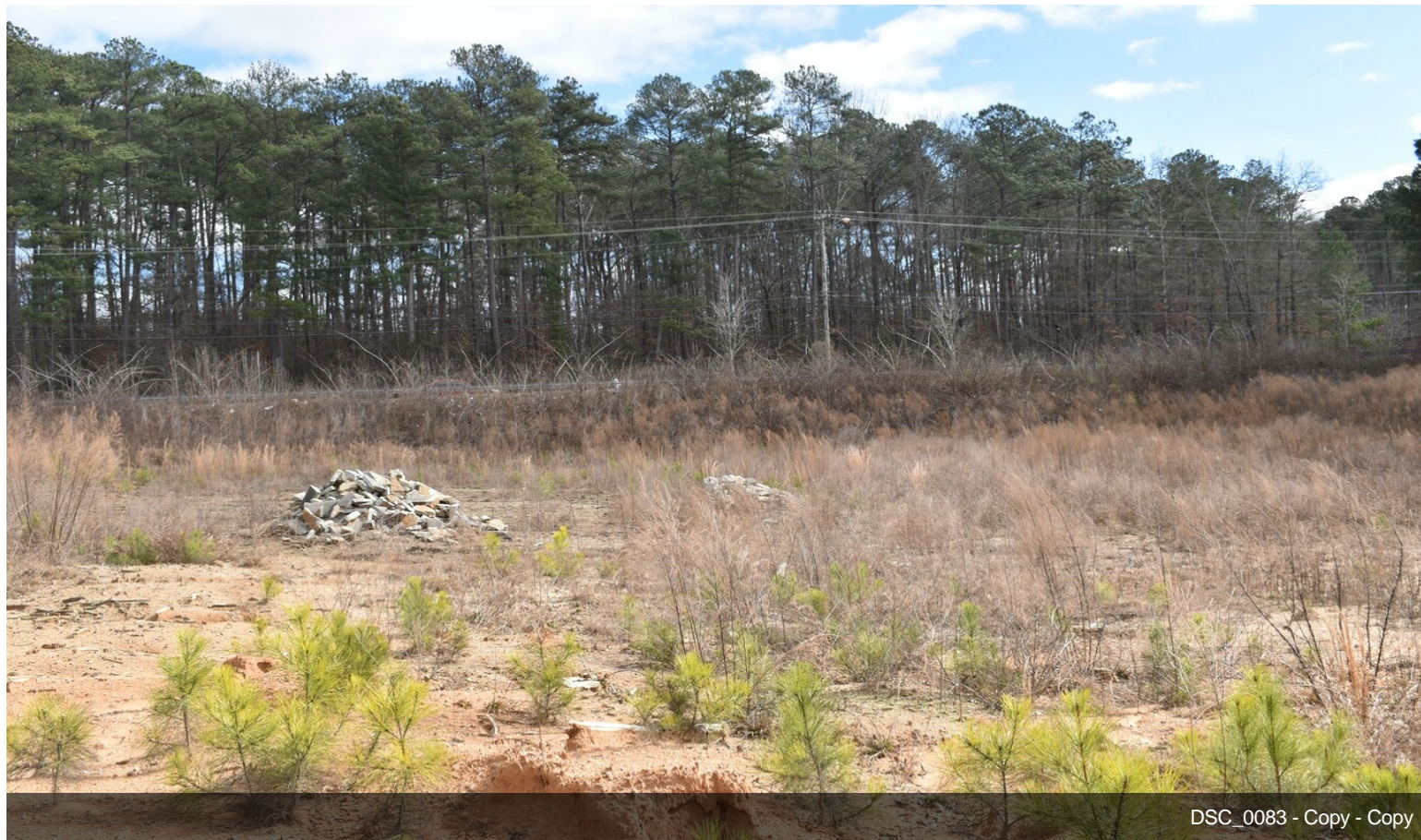
DSC_0083 - Copy - Copy