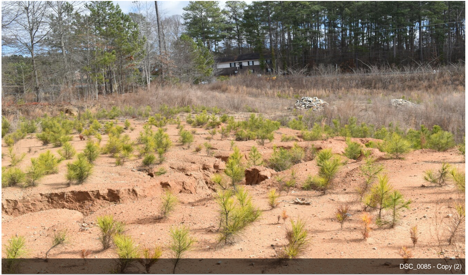
DSC_0085 - Copy (2)