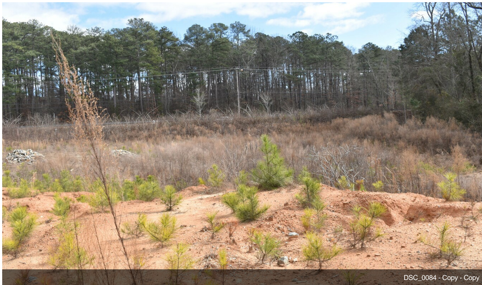
DSC_0084 - Copy - Copy