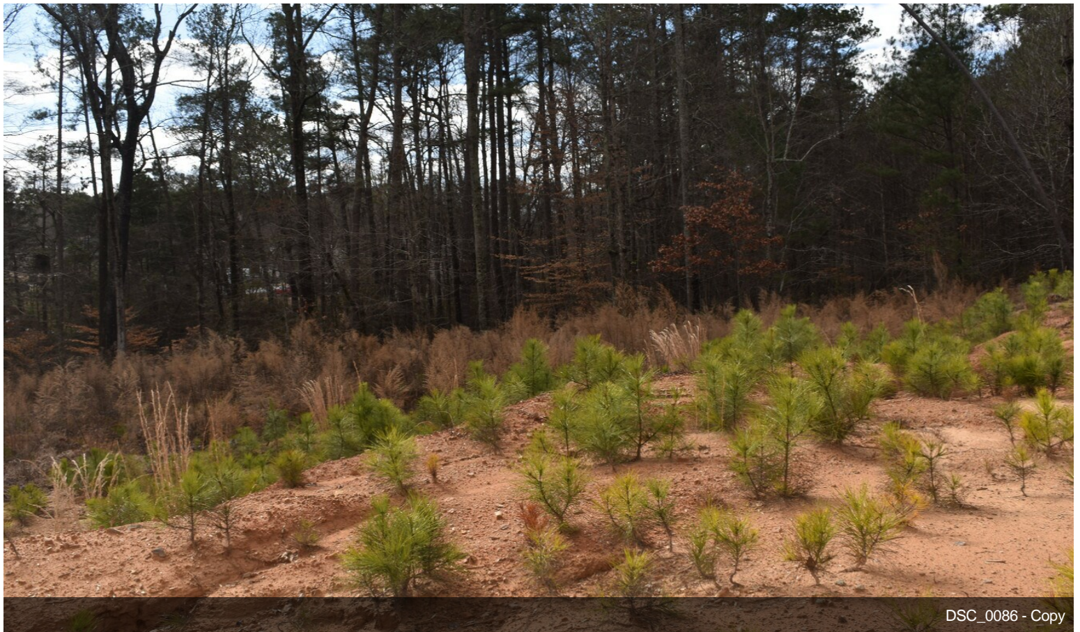
DSC_0086 - Copy