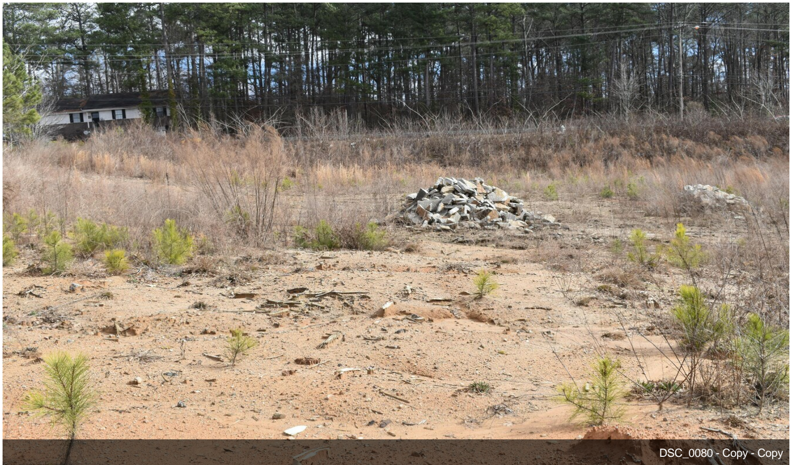
DSC_0080 - Copy - Copy