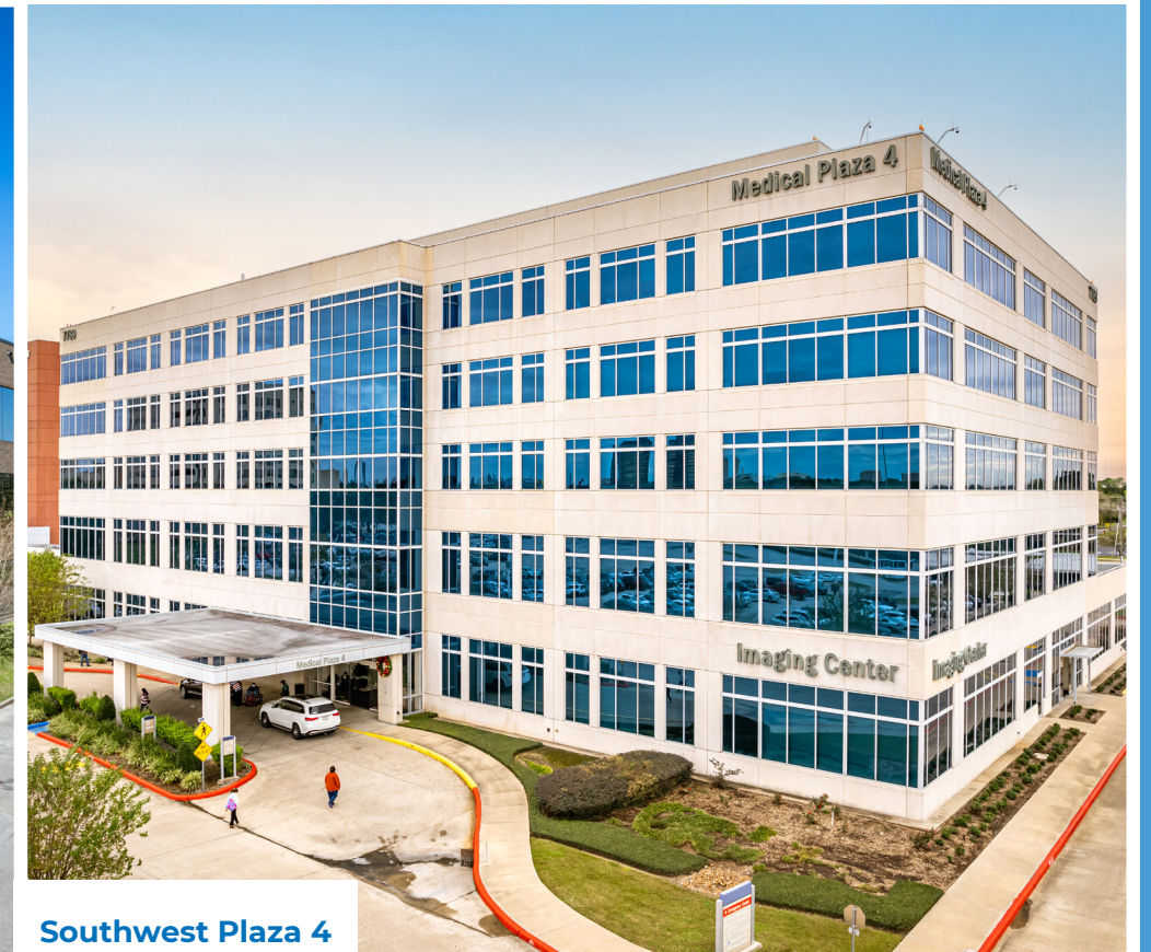
Southwest Plaza 4