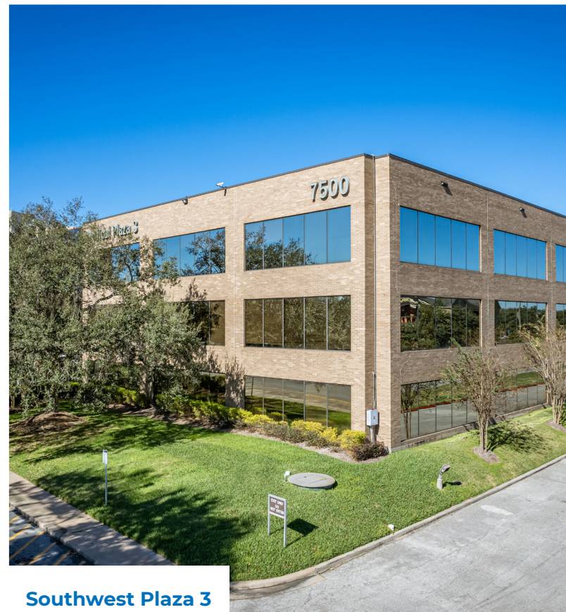
Southwest Plaza 3