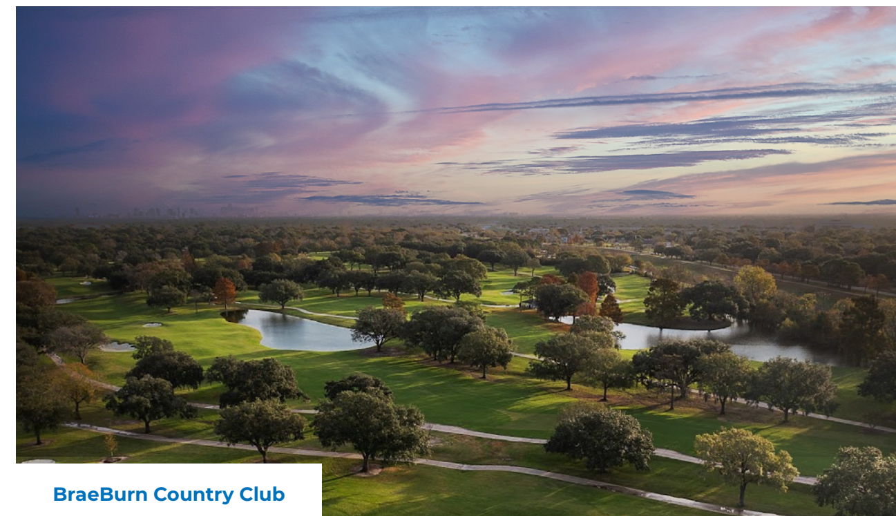
BraeBurn Country Club