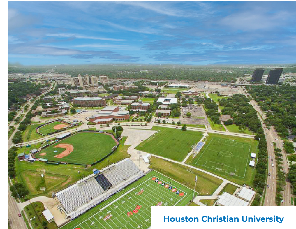
Houston Christian University