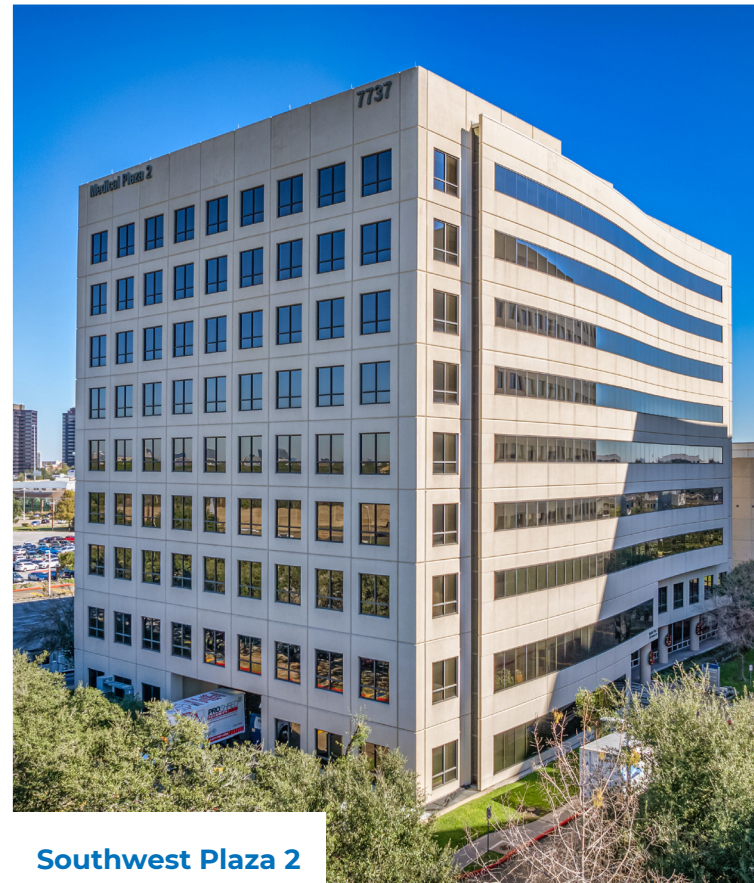
Southwest Plaza 2