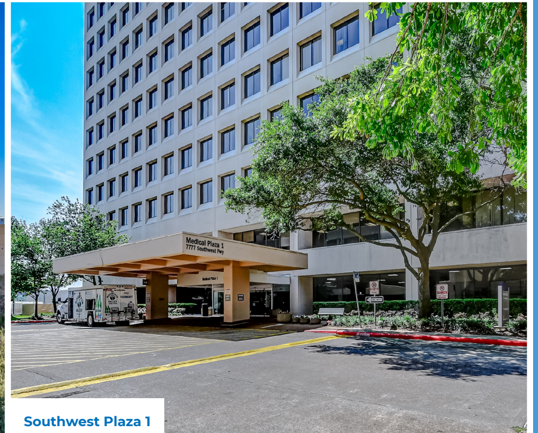
Southwest Plaza 1