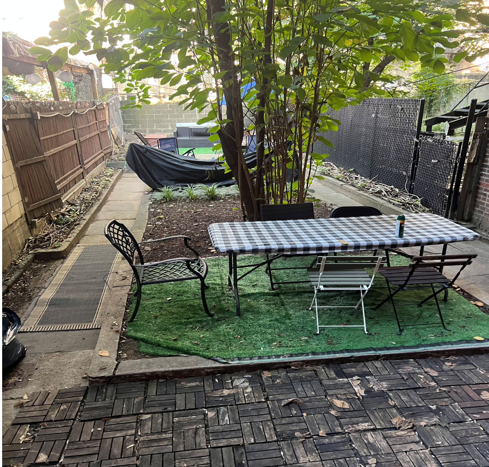
Beautiful & Private Backyard