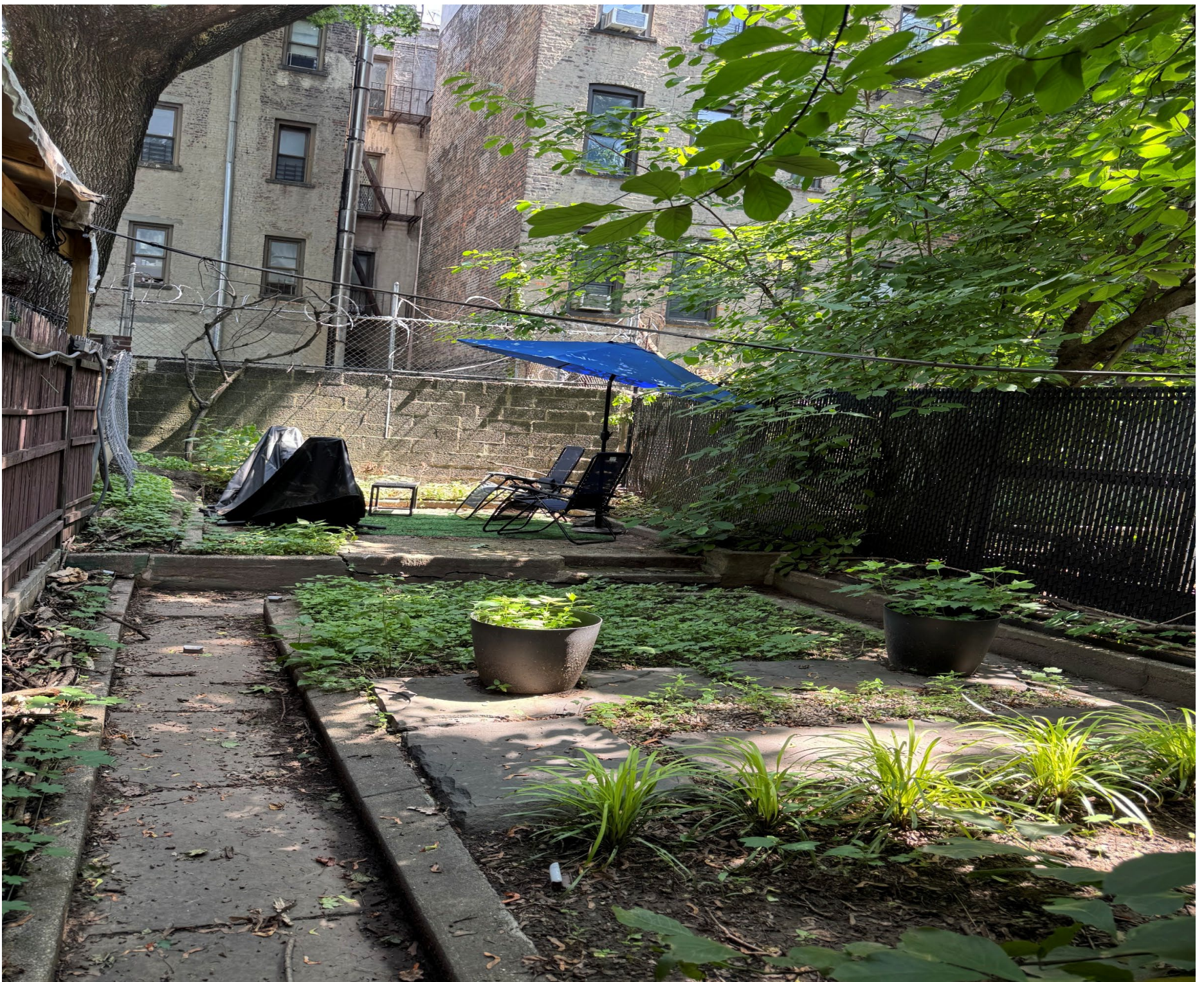
Private Back Yard