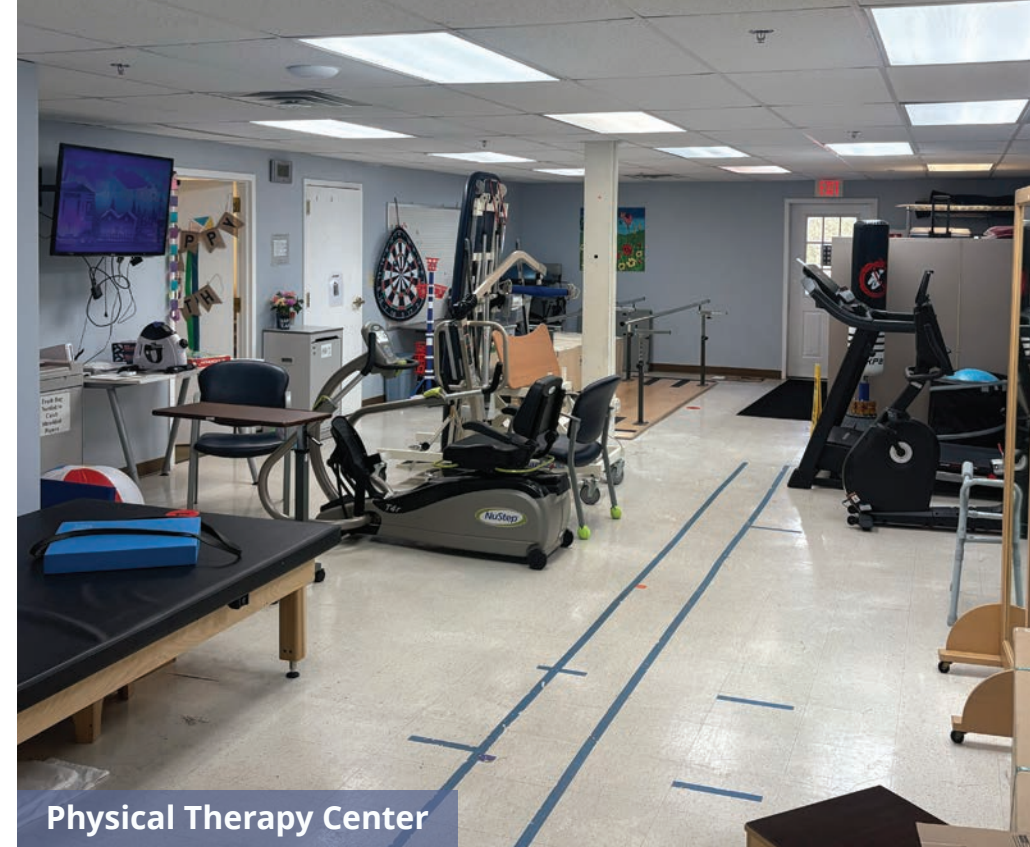
Physical Therapy Center