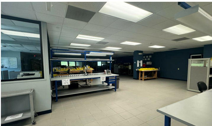
Work Area (Middle)