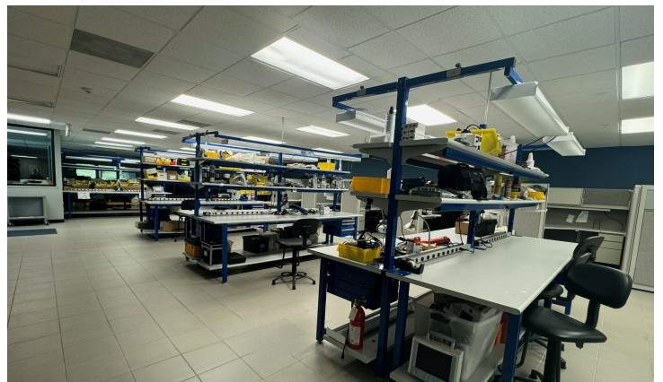
Work Area (South)