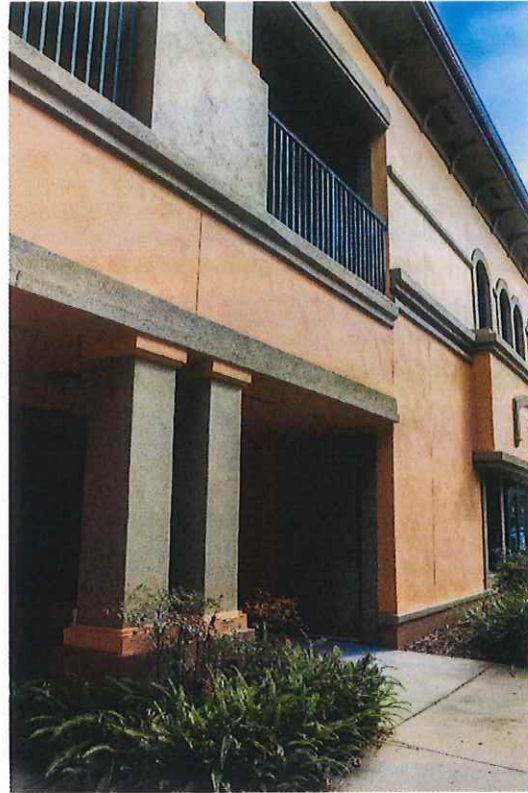
Heavy foot-traffic, an elevator, and stairwells on either side of the building.