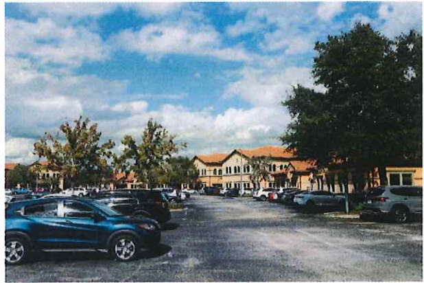
Lots of parking both in front of and behind each building in the plaza.