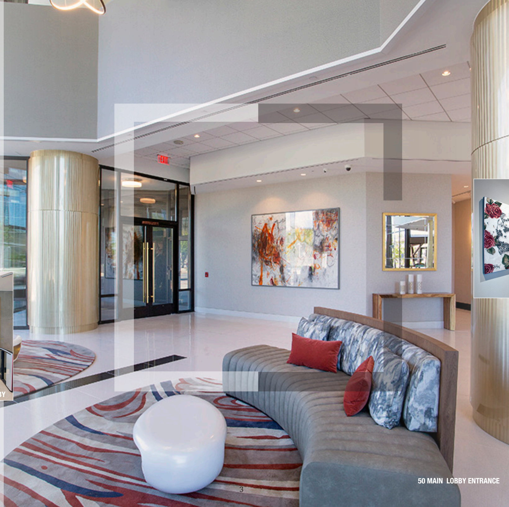
50 MAIN LOBBY ENTRANCE