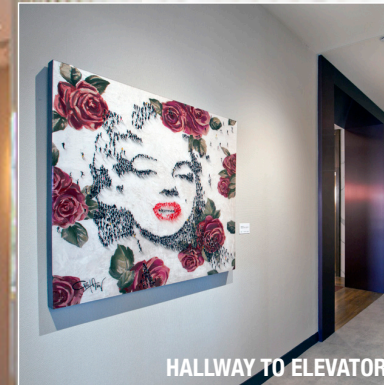
HALLWAY TO ELEVATOR

The 50 Main Street Art Gallery and lounge is curated by Arts Westchester that features paintings and sculptures from both local and national artists.