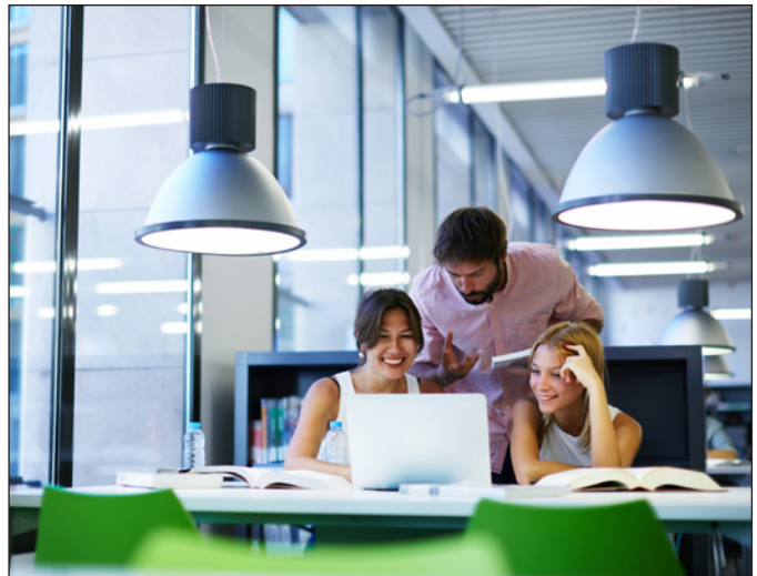
Hi tech modern open office space designs

For a private tour of this office building contact: