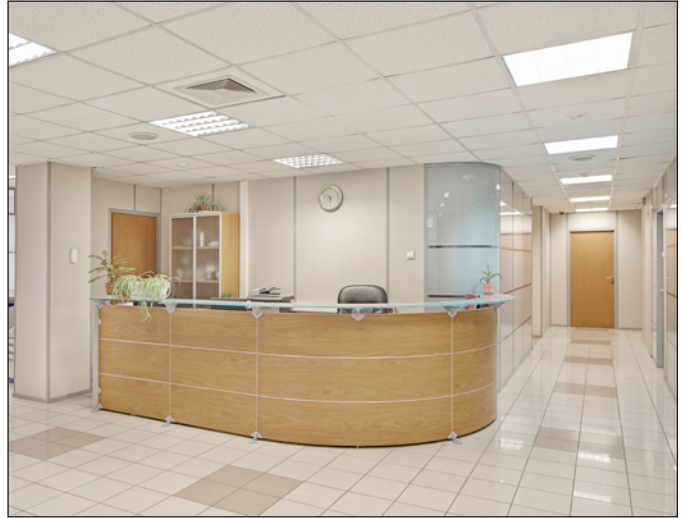
Custom build outs for all business needs