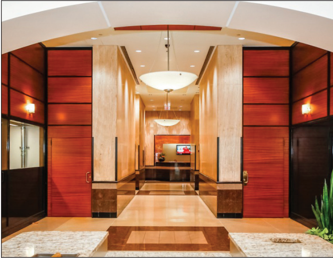
Modern lobby and common areas