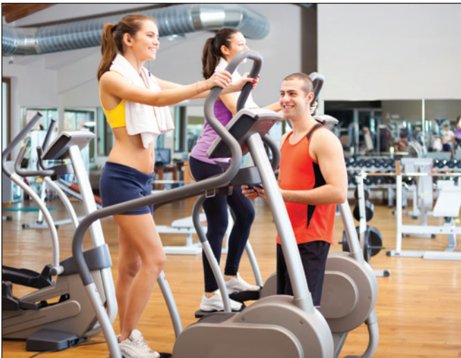
Complimentary fitness center on premise