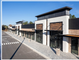
DUNNS CREEK CROSSING