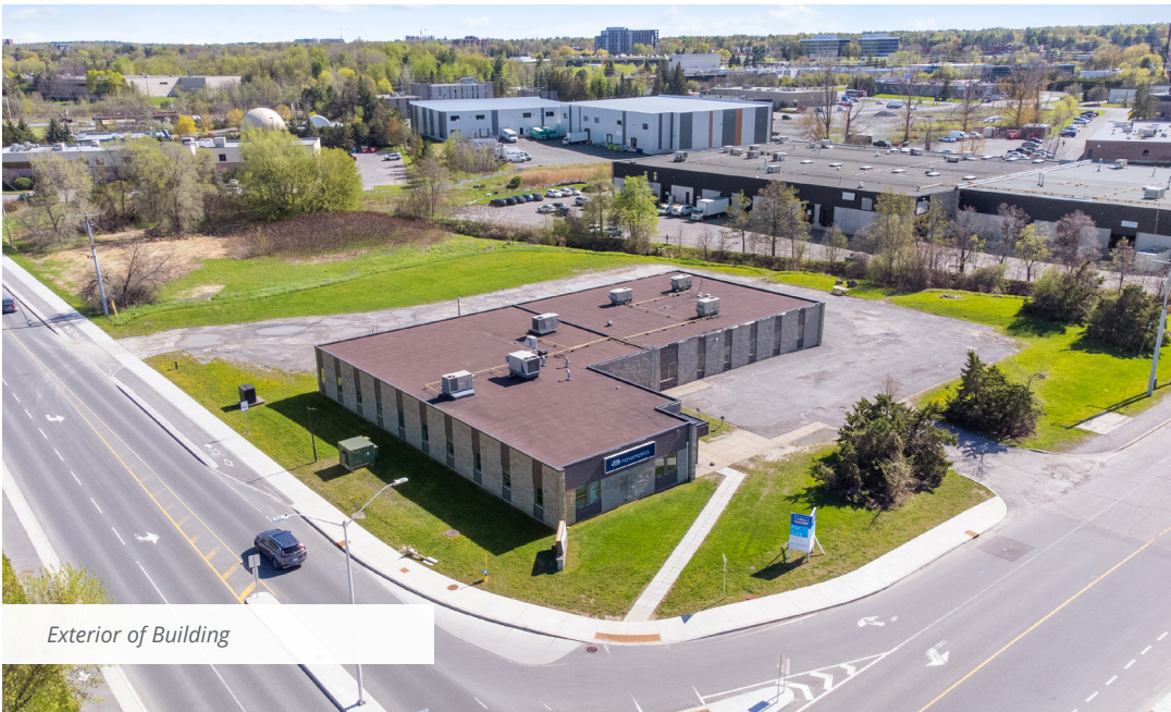
Exterior of Building