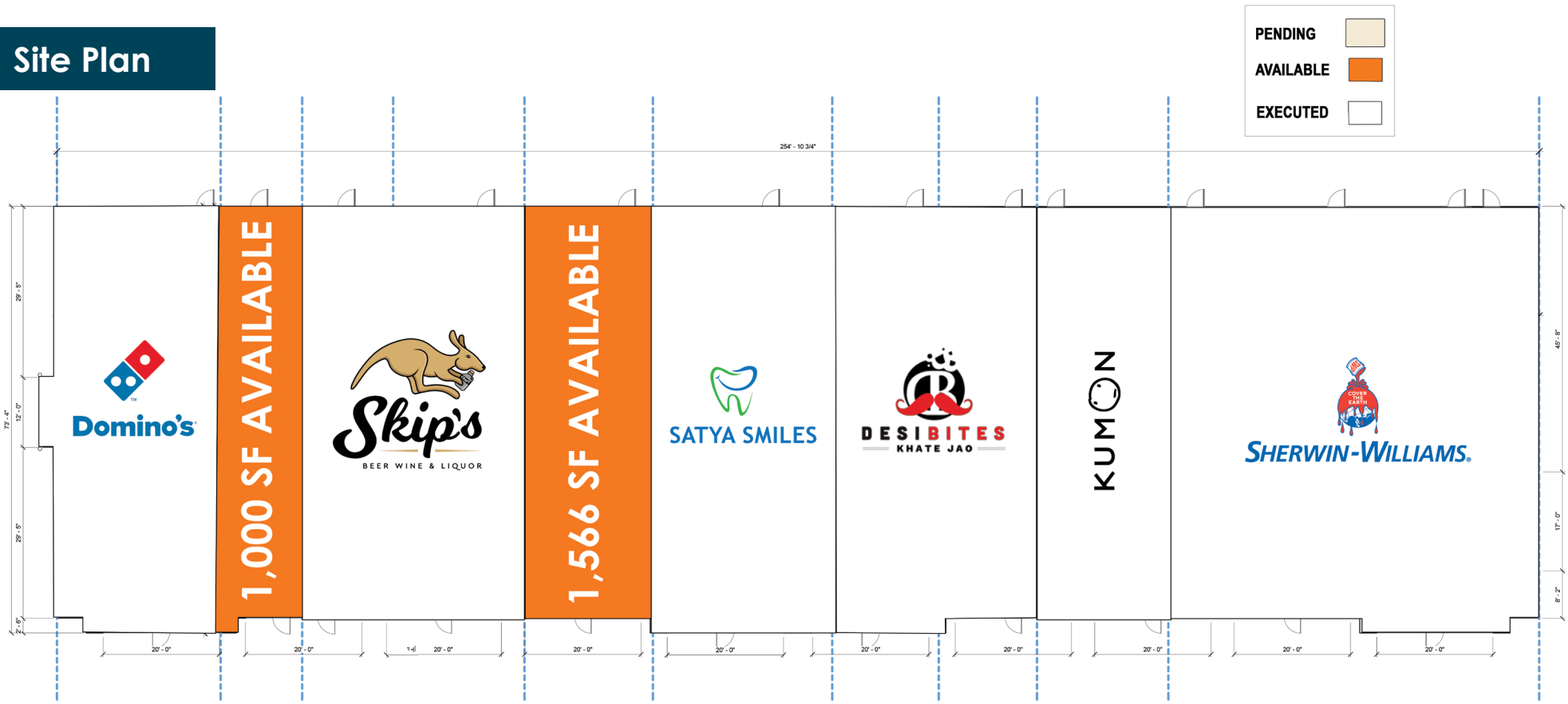
1 LEASE FLOOR PLAN SCALE: 1/8" = 1'-0"