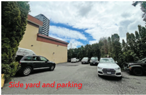
Side yard and parking