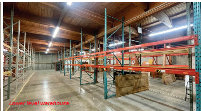
Lower level warehouse