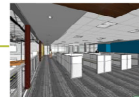
Second Floor Open Office Work Area