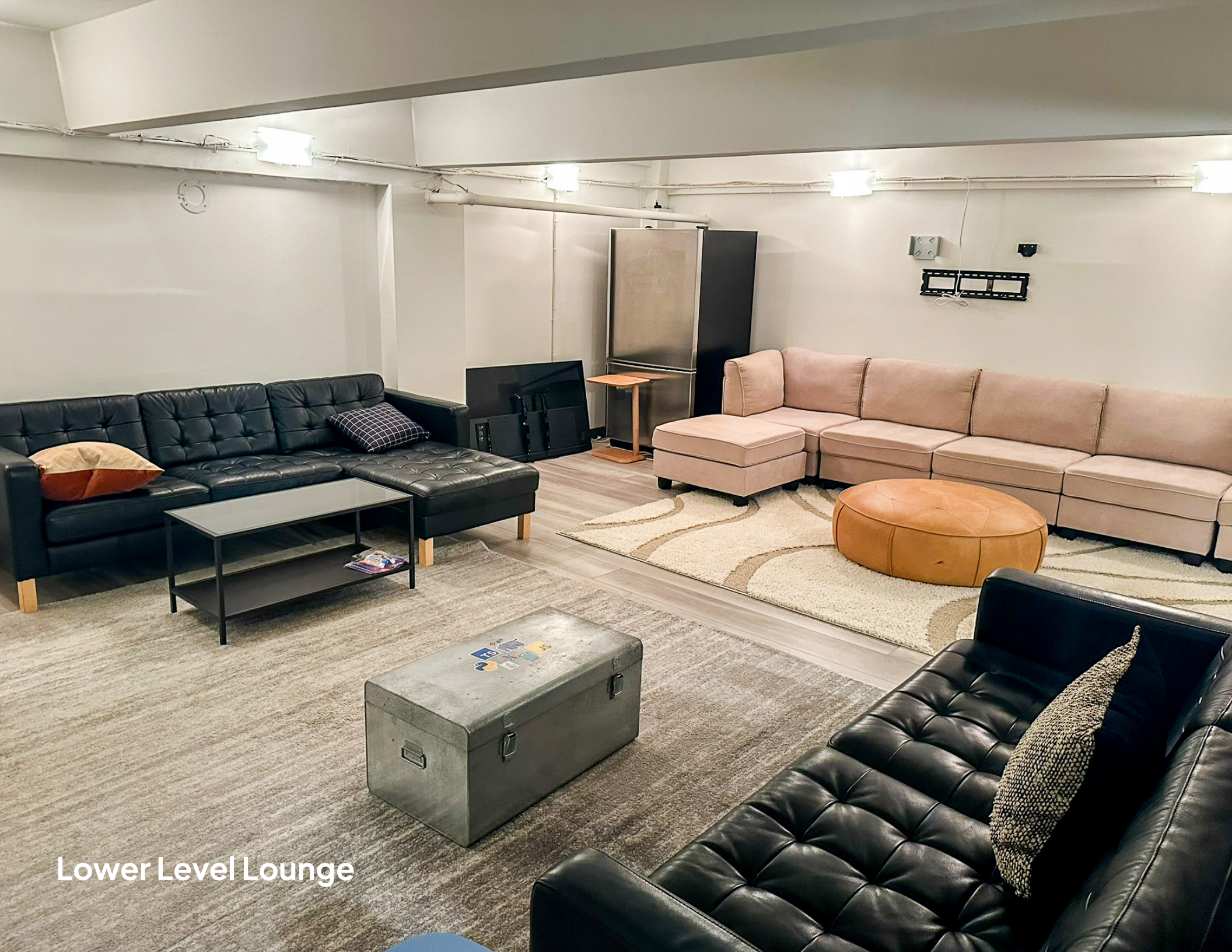
Lower Level Lounge