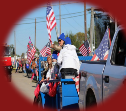
Red, White & Blue Festival