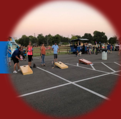
National Night Out