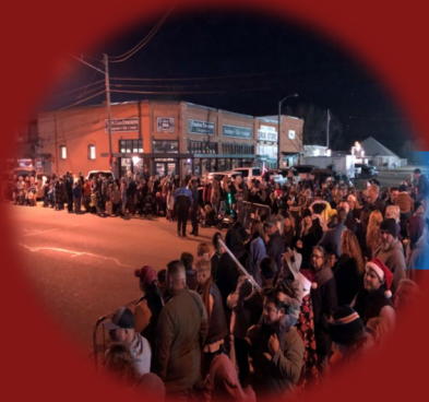
Christmas Kickoff Festival & Parade