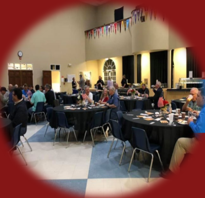
Mayor's Prayer Breakfast