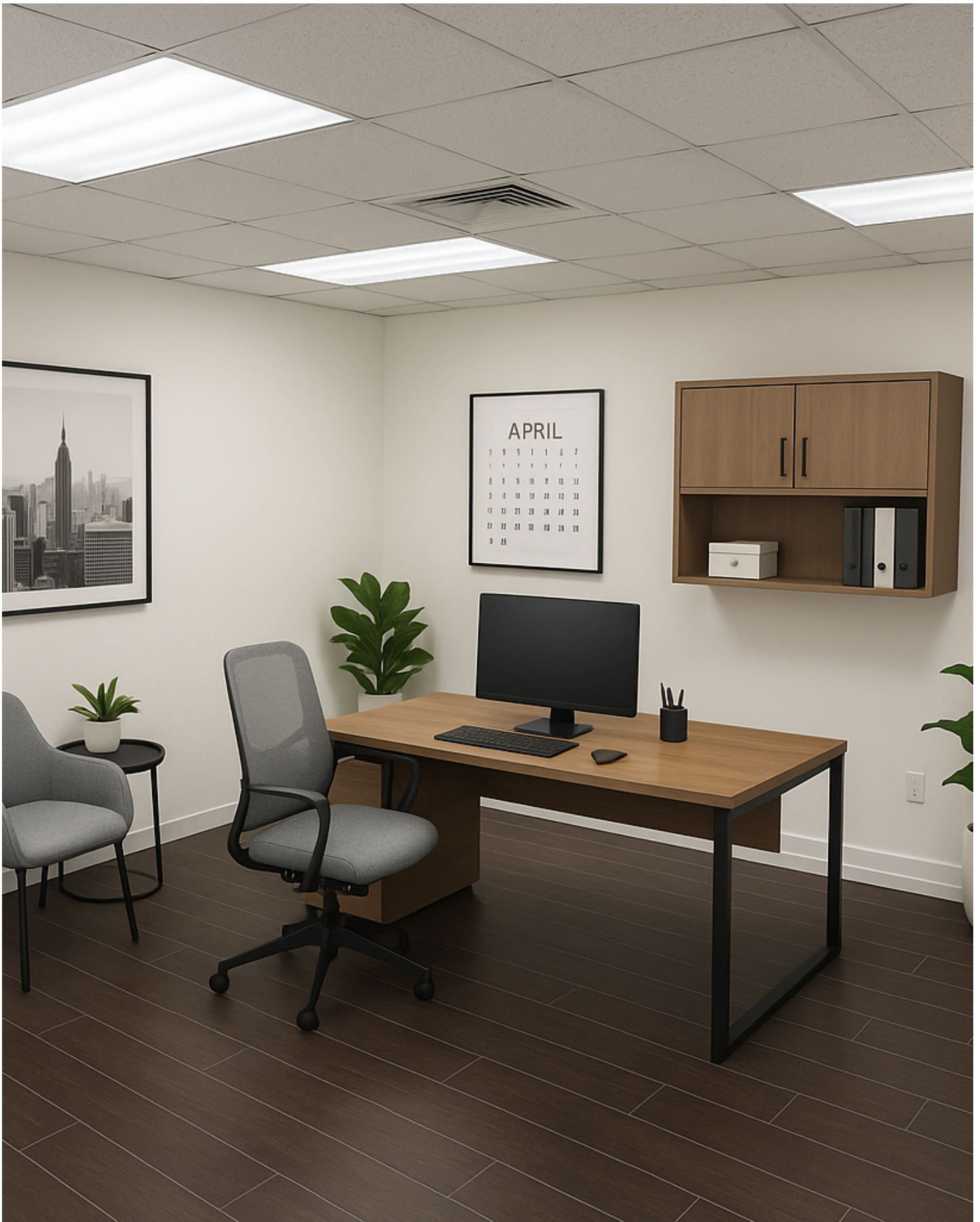
Conference or Administration Room