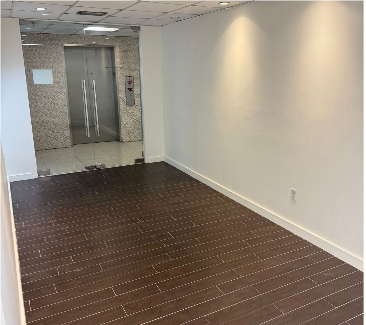
Entrance - Reception

1,300 sq. ft. office fully built out with three windowed offices, a conference room - administrative room without a window, plus a reception area. All interior doors are glass, including the entrance. Two assigned parking spaces are included, along with ample free additional parking for tenants and visitors. $4,000 monthly. Full service includes electricity, AC 24/7, and janitorial services. Access to the building 24/7